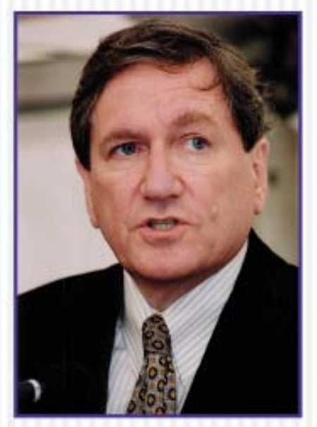
HOLBROOKE Iraq , Mandela, and Peace 10