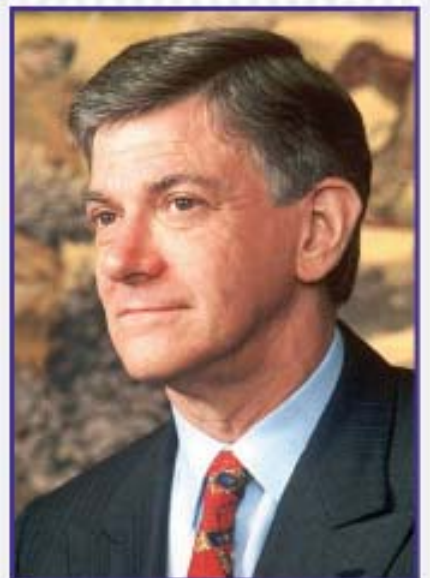
VILAR The Future of Tech Stocks 23