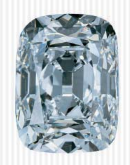
THE NEXT KERZNER 68