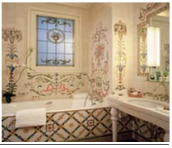
Clockwise: The elegant Hotel Raphael; What could be better than champagne and a view? The rooftop dining terrace and Arc de Triomphe; Hand-painted bathroom; the Raphael suite; the beautifully furnished lobby