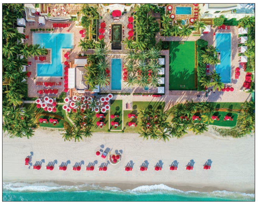
Acqualina Resort beach and pools

We are committed to the highest levels of health and sanitation practices, and never hesitate to invest in resources, tools and equipment that will improve the safety and well-being of our people and overall community. Our mission is to constantly strive to do better at every level.