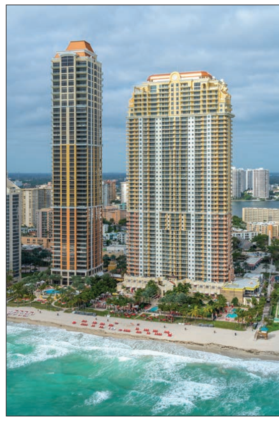
Acqualina Resort & Residences on the Beach

What additional procedures and protocols has Acqualina put into place to provide guests with confidence around safety and health concerns when visiting the property?