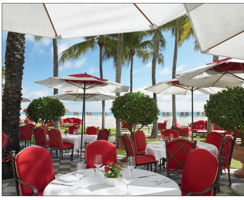
Beachfront dining at the Costa Grill

cies and procedures. term. We are constantly in our facility, especially of our people and overeducational workshops to inspire passion and further commitment.