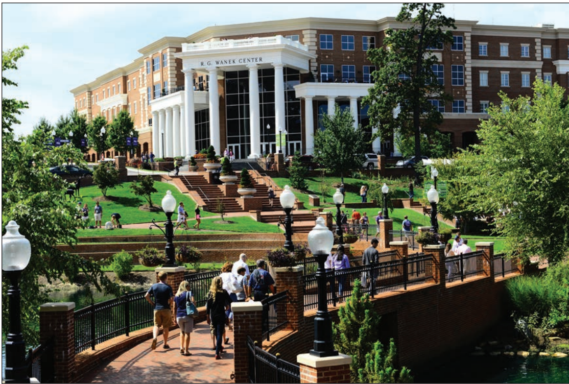
R.G. Wanek Center at High Point University exterior (above) and Wanek School of Natural Sciences lobby (below)

Now, look at where HPU is today. U.S. News & World Report has named HPU #1 Best Regional College in the South for 9 consecutive years, #1 Most Innovative for 6 consecutive years and is among the nation's Leading Top 50 First Year Experiences. HPU has also been included in The Princeton Review's "America's Best Colleges" for four consecutive years, where HPU is also ranked #1 for Best Dorms, #9 for Most Beautiful Campus, #19 for Best Career Services and #19 for Most Active Student Government Association.