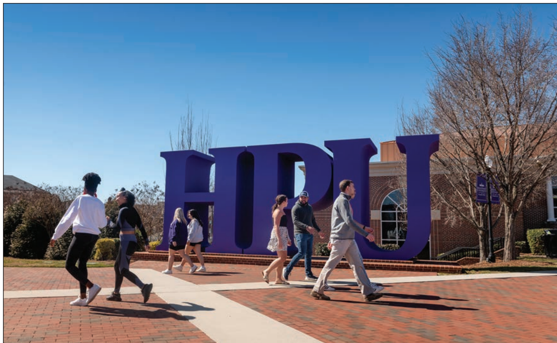
Students on the HPU campus