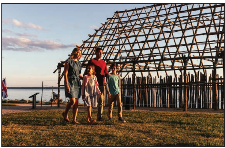
A family at Historic Jamestowne

The opportunity to call on my experience in both government and the private sector to build a brand new destination marketing organization from the ground up, coupled with the challenge of reinvigorating visitation to the region, is what drew me to the position.