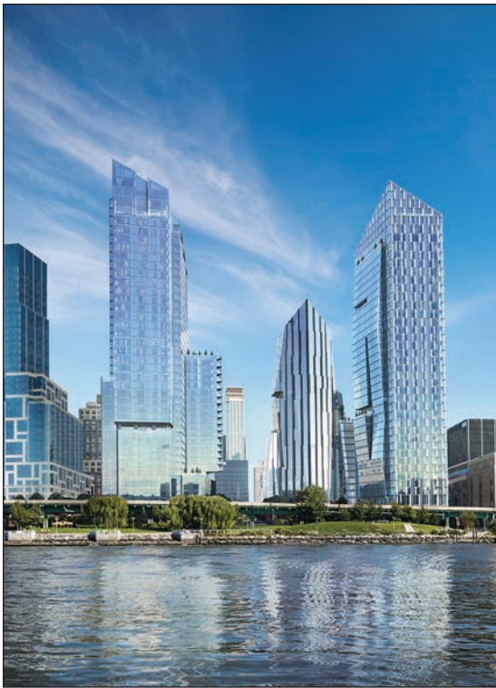
Waterline Square on the Hudson River on the Upper West Side

comprised of more than 7,000 multifamily units and two million square feet of commercial space. Projects are located throughout the United States and range from luxury high-rise multifamily towers to large-scale, multi-phase, master planned mixed-use projects consisting of residential, retail, restaurant, entertainment, office, hotel, cultural and public realm uses. While we have numerous projects in various stages of the development process throughout the country, perhaps I will highlight just a few award-winning examples.