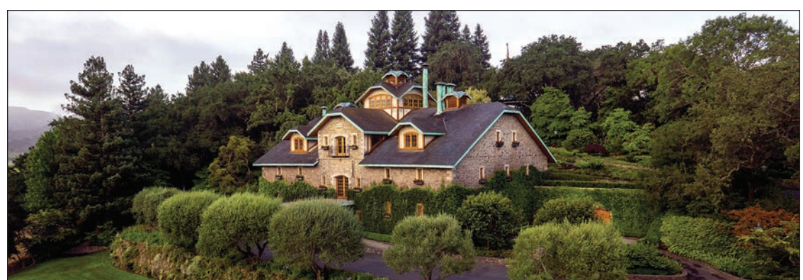
Far Niente Wine Estates in Napa Valley (above); the winery's north cave doors (top); and a selection of Far Niente wines (opposite page)

What have been the keys to the consistent strength and leadership of Far Niente Wine Estates in the industry?