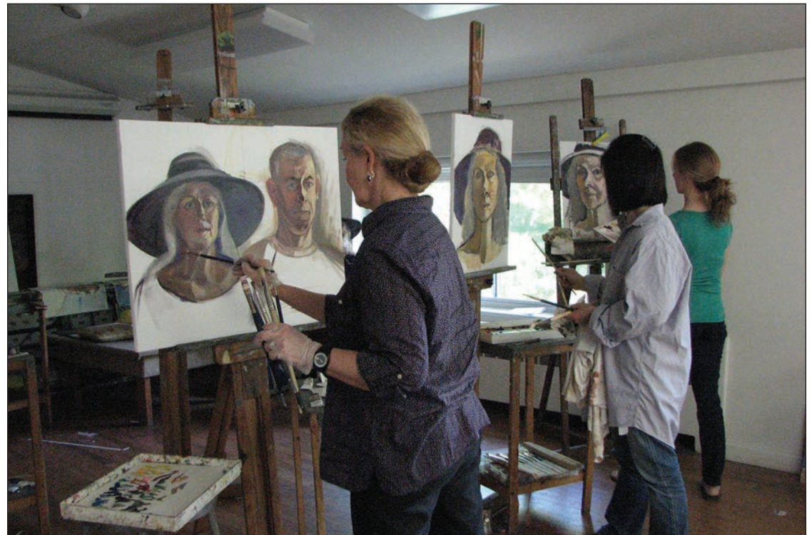
Adult portrait painting class