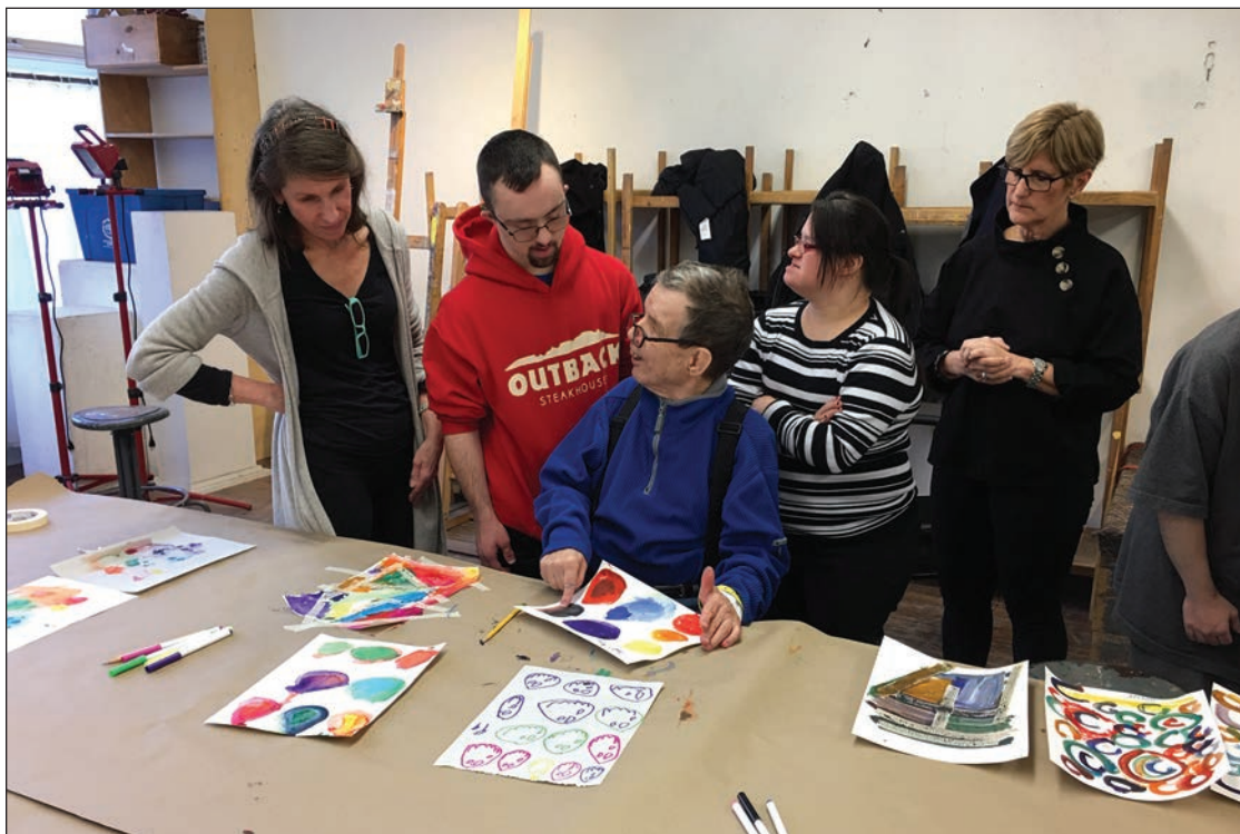
Silvermine's ArtAcademy outreach program reaches into the community to inspire creativity

ArtAcademy offers the resources and pathways for adults with I/DD to explore, develop, and share their talents – and perhaps even discover skills that might lead to career development.