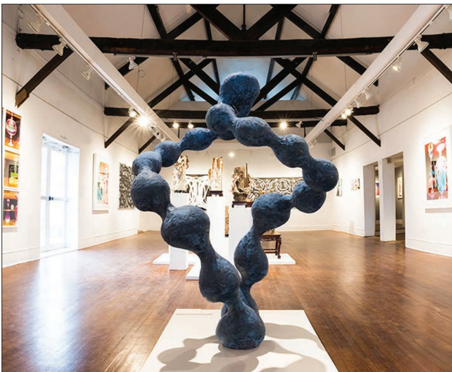
New Members Exhibition at Silvermine Galleries

Silvermine also seeks to use exhibitions in our galleries as a springboard for conversations about aesthetic ideas, humanities themes, and interdisciplinary contexts. Our galleries are free and open to the public, as are most of our programs, reflecting our goal to enrich the lives of diverse artists, students, and visitors from all social, economic, and educational backgrounds. Silvermine continually aspires to strengthen its role as an inclusive gathering place for transformative experiences with art that inspires creativity.