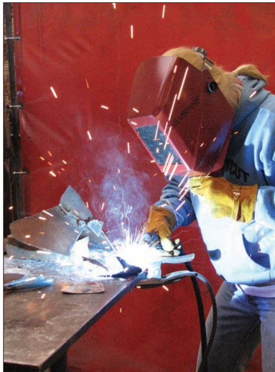
Bronze pour and metal working in the sculpture studio

What sets Silvermine apart and entices students to join and stay is its exceptional faculty of dedicated instructors. Additionally, the institution boasts the broadest array of disciplines available in the region, offering students unparalleled opportunities for artistic exploration. Indeed, there is no other place quite like Silvermine.