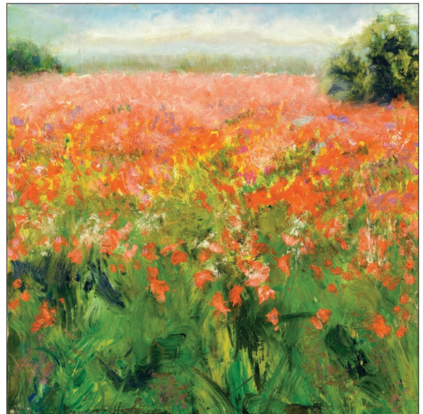
Flowers in the Field, 36 x 36, Oil on canvas by Jan Dilenschneider