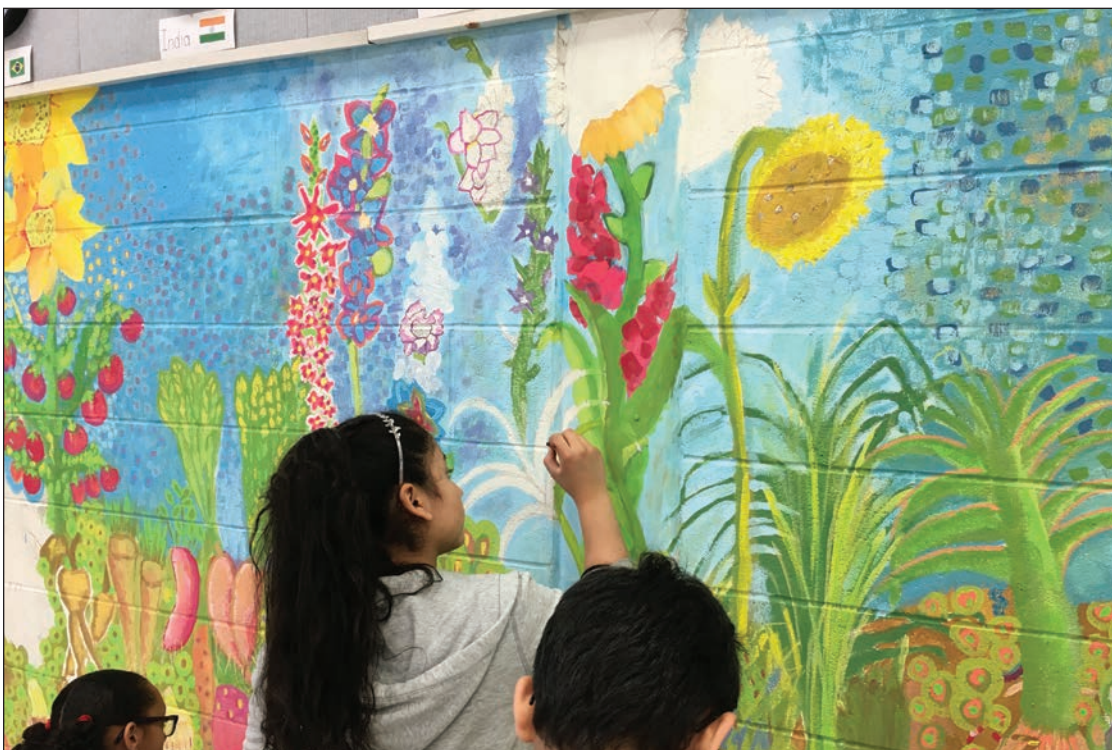
Silvermine's Art Partners outreach program 5th grade mural project

Linarducci: We support each other and we are all committed to leaving Silvermine better than how we found it. ●