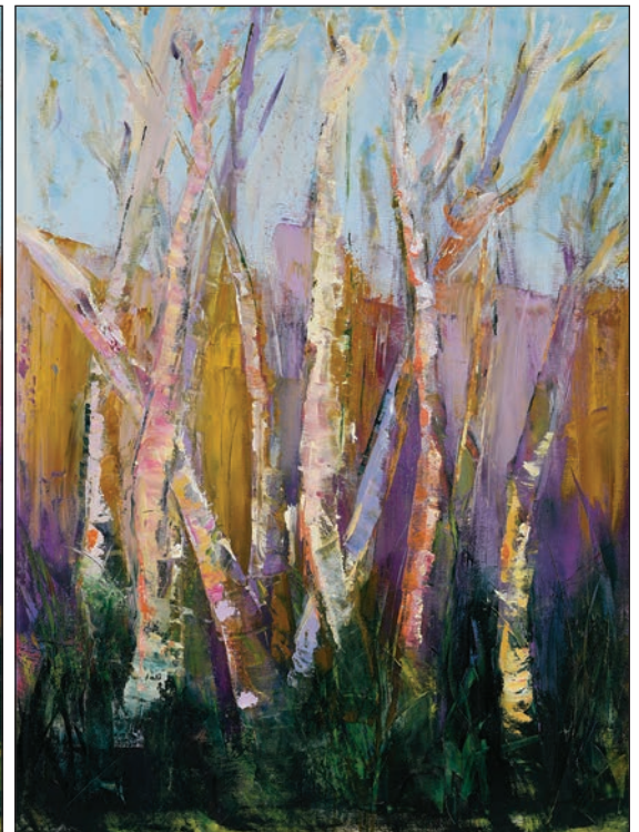
Colorful Birch Trees, Diptych, Mixed Media 30 x 40 each by Jan Dilenschneider

much needed life skills, and even create the next generation of artists and innovators.