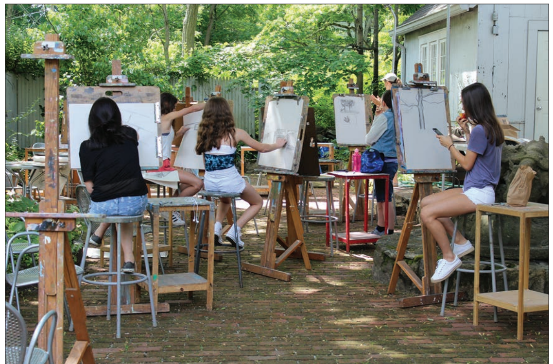
Teen plein air painting class in the Galleries garden

Today, the renowned School of Art stands as the premier educational institution for visual arts in Fairfield County. With an impressive enrollment of over 4,000 students annually, spanning from ages 4 to 94, it caters to individuals at all levels of artistic proficiency, ranging from beginners to advanced practitioners. Offering a diverse selection of more than 1,100 courses, workshops, and youth programs throughout the year, the school cultivates a nurturing environment. It strikes a balance between providing the freedom to explore one's creativity and instilling a strong foundation through disciplined instruction.