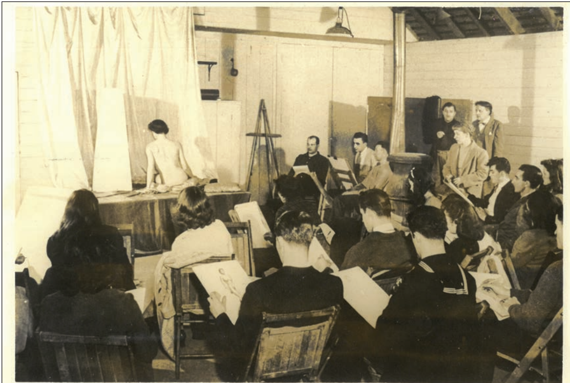
1930s figure drawing class at Silvermine Arts Center