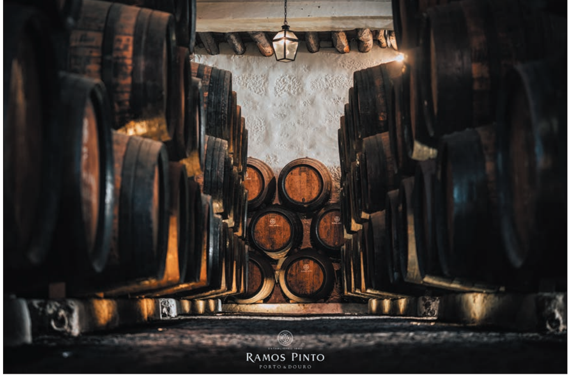
Ramos Pinto cellar

More recently and for the first time in our long history, we released two new DOC Douro wines: Quinta de Ervamoira, which is produced with grapes from the best plots of this property, and Urtiga, which is made with grapes from a century-old vineyard. With these two releases we entered a new era of Douro wines, as we delve into the distinctive terroir of Ramos Pinto.