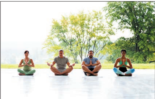
Fireside Lounge (top right); indoor pool, salon, yoga and meditation (above - left to right); fitness center, facial, massage (below - left to right)

From transformative, cutting-edge signature therapies and traditional, holistic practices to pure, unadulterated luxury spa treatments, guests of the Woodlands Spa and Salon at Nemaquin ( nemaquin.com ) define what self-care and wellness mean to them, and then discover unique offerings and special services they won't find anywhere else to relax, rejuvenate, and indulge. Woodlands Spa and Salon provides forty treatment rooms, a full-service salon, a skillful and attentive staff, a diverse range of treatments, and services that soothe the mind, body, and spirit.