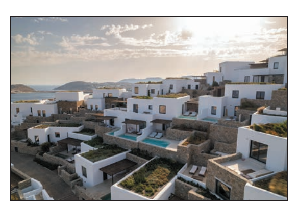
Built On The Nostalgia Of A Family

Founder, Brooklyn Fare Kitchens & Markets and Chef's Table at Brooklyn Fare