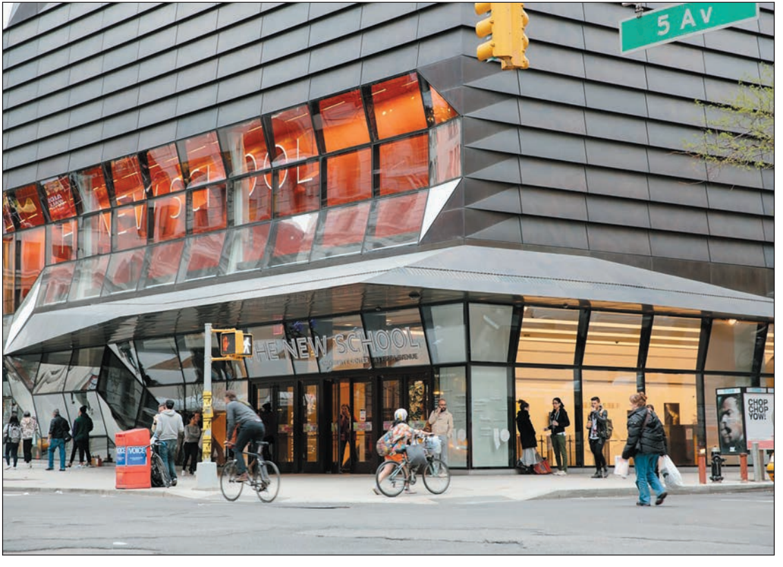
The New School

There has been positive change, especially due to technology. Teachers are better educated, and students have more opportunities in our schools. We still have not paid teachers adequately and we have not supported teachers adequately, but when I look back at how I was taught and how students are being taught today, it is fundamentally different in large part due to the impact of technology as well as having teachers who are better trained and much more sensitive to the differences of the students in their classrooms.