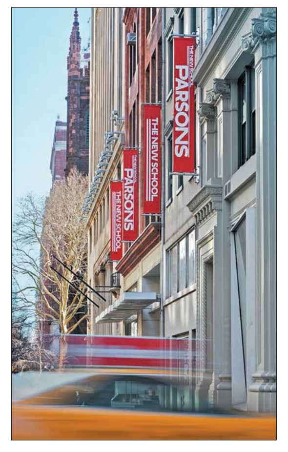
Parsons School of Design

It is very valuable, but it does not mean that I repeat things from other institutions. I look at the uniqueness of each institution and I try to understand the specific culture. There is no question that my many years running complex institutions helps, in part because it makes you fearless, but my focus is on what is needed at the time for the institution I am leading.