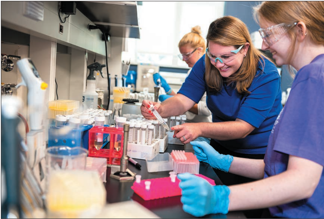
HPU students gaining experience by participating in summer undergraduate research

High Point University. Like David, HPU has an entrepreneurial mindset.