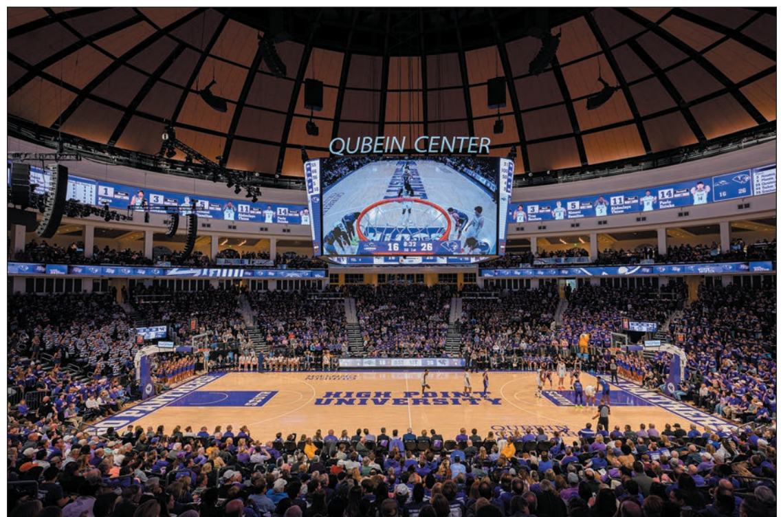
Qubein Center at High Point University