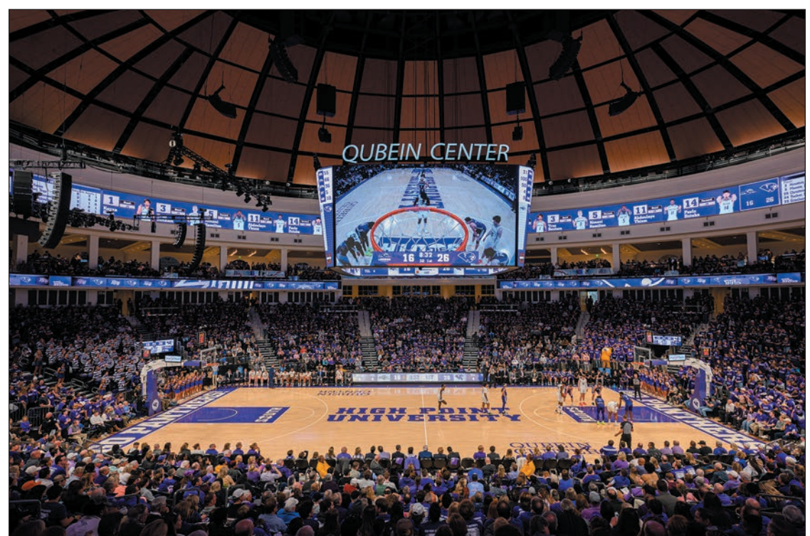
Qubein Center at High Point University