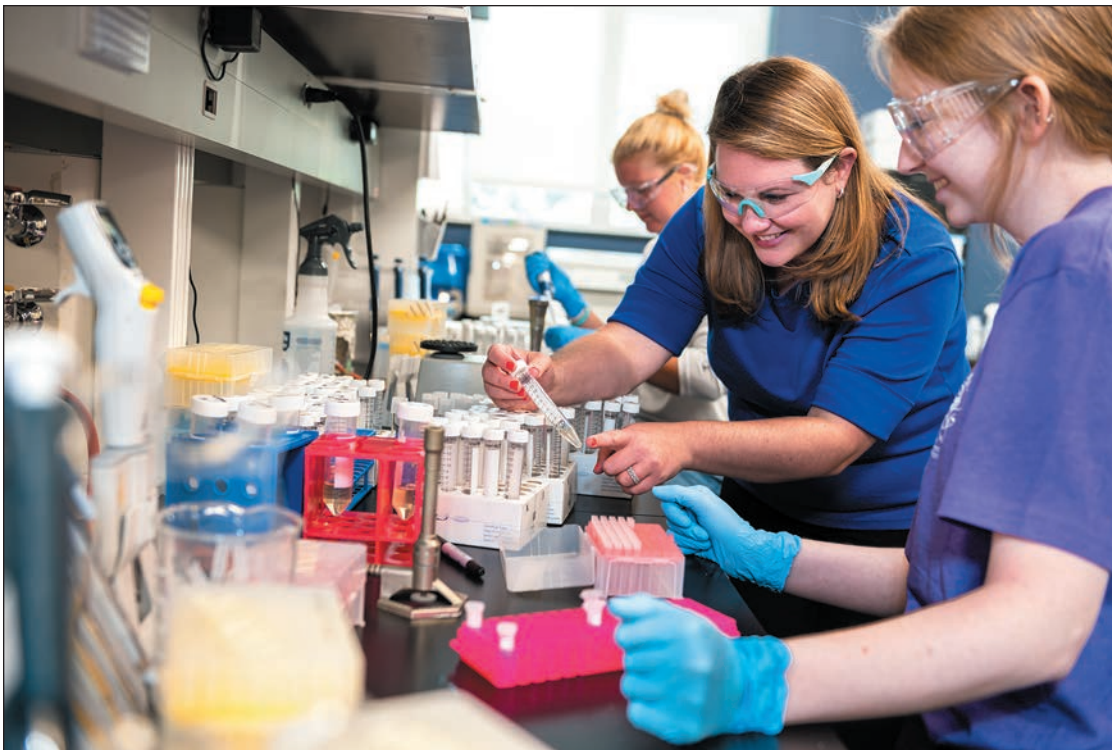
HPU students gaining experience by participating in summer undergraduate research