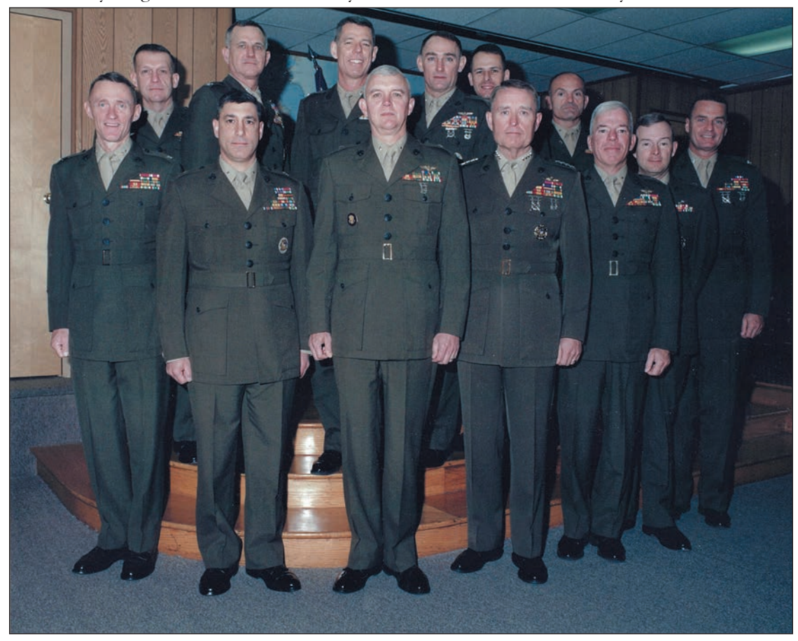
Newly selected Marine Corps Brigadier Generals meeting with Marine Corps Commandant

My life began in 1943 and I'm now in my 80th year. I have been very fortunate to have been able to live my life as an American