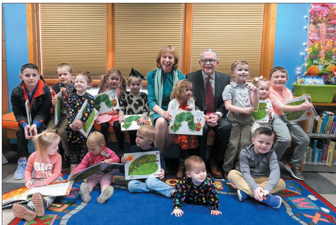
First Lady Fran DeWine and Governor Mike DeWine pose with local children from Malvern during a reading of The Very Hungry Caterpillar at the Carroll County Public Library to promote enrollment in Dolly Parton's Imagination Library of Ohio

Having access to the internet has become an absolute necessity for living and thriving in today's world, but unfortunately, reliable, low-cost connections are lacking in many communities throughout