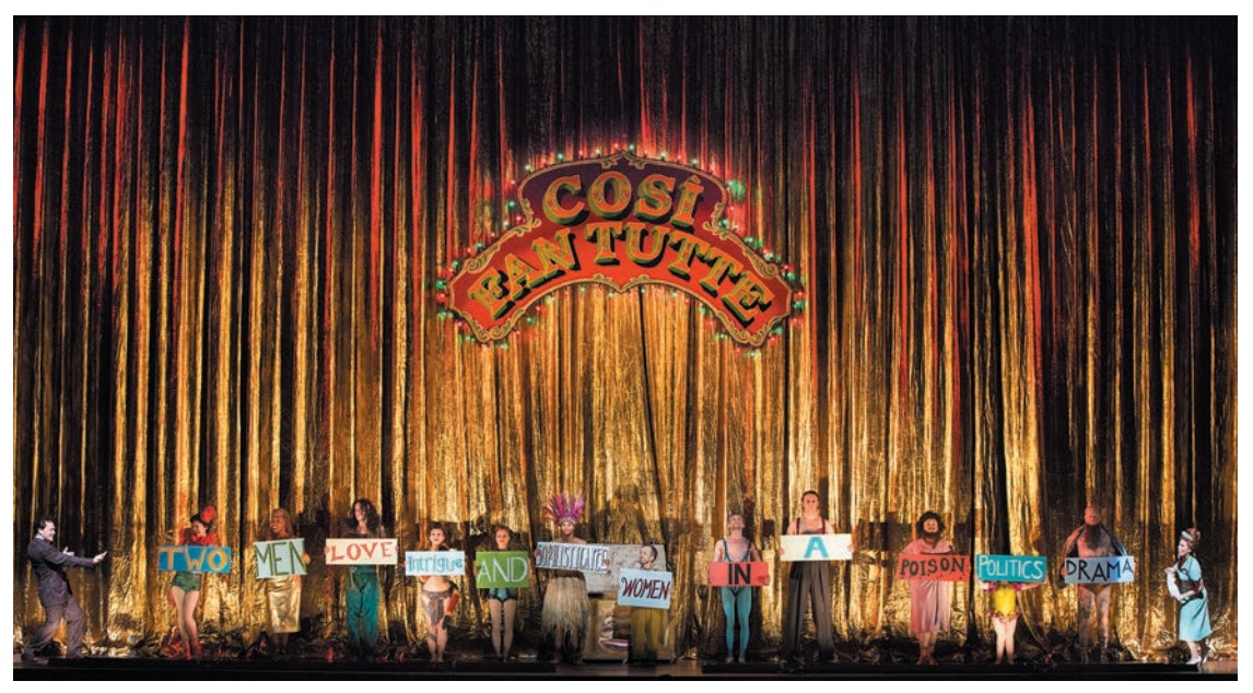
A scene from Act I of Mozart's "Così fan tutte"

When I was 16 and a junior in high school, my father persuaded the Met to hire me as a part-time usher. My station was in the family circle standing room, the nosebleed section at the very top of the Met's auditorium, where I had my first exposure to some of the Met's most devoted fans who would often fight with each other over their favorite singers. My job was to break up the fights or to call in reinforcements.