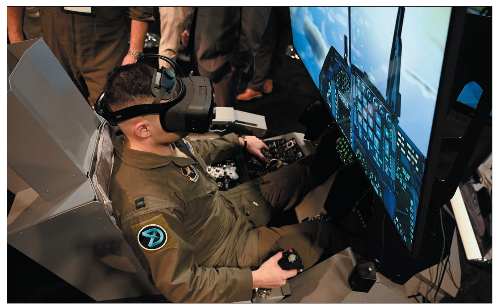
F-16 Mixed Reality Reconfigurable Fighter Trainer (MR-RFT) — Vertex delivers numerous mixed reality aircraft configurations (The appearance of U.S. Department of Defense (DoD) visual information does not imply or constitute DoD endorsement)

As hundreds of pilots are actively using our XR flight simulators, we gain continuous and invaluable access to a rich source of user acceptance data. There are very few companies that deliver similar XR simulators at this scale that also undergo daily use by instructor and student pilots. We make high fidelity training accessible, responsive, current, and affordable, bringing the training to our users, addressing the costly (in terms of dollars and time) problems of where to train so we can focus on the how.