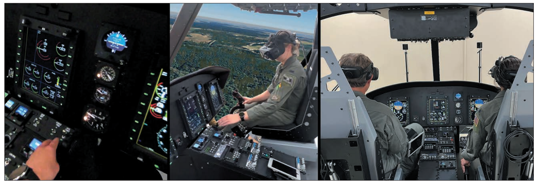
Multi-place Mixed Reality (MPMR) - Integration of real-world avionics within a virtual environment

We have already delivered more than 300 of our simulators to the Air Force, the Navy and commercial aviation customers. This spring, we will have employees providing pilot training with our XR simulators at nine military installations and one airline. We are also partnering with one of the leading eVTOL developers, producing a similar XR simulator for them with the expectation of receiving FAA certification for flight equivalency training.