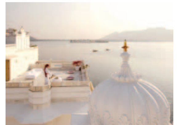
Lake Palace, Udaipur: Swimming Pool (top); Spa Treatment Room (center); Private Sit Out (bottom)

I probably meet more people than the people internationally traveling and coming to my hotel. Obviously, I meet many people who are tourists. But at the same time, I give a lot of my time to interacting with global and Indian influencers and decision-makers. It is a great learning exercise for me, helping me to remain contemporary and relevant as a Custodian. ●