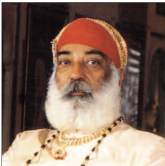
Shriji Arvind Singh Mewar of Udaipur

An Interview with Shriji Arvind Singh Mewar of Udaipur, 76th Custodian of the House of Mewar