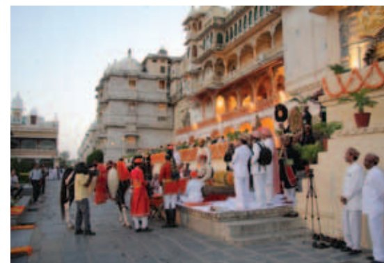
Shriji Arvind Singh Mewar of Udaipur worshipping the horse on the occasion Ashwa Poojan at the Manek Chowk, City Palace Complex, Udaipur (above)

The challenge, first for my father and now for me, is how to continue to discharge our age-old responsibilities as the head of the House of Mewar. I understand and I accept that we now have no constitutional responsibilities today. We are not in the business of active elective politics, which is also our choice. And yet the desire is that this house should continue to function in