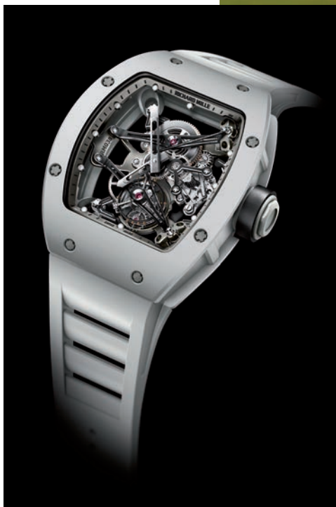
Professional golfer Bubba Watson sporting the RM 038 (inset) at the Zurich Classic in New Orleans