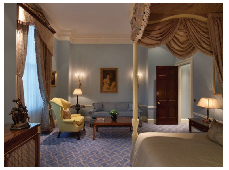
munity and did you know it would work? The Lanesborough Suite living room (top); master bedroom (above); and second bedroom (bottom left)

Has the general manager role evolved into a financial role or is it still more of a hospitality role?