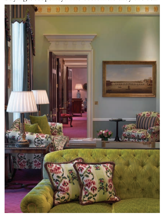
The Lanesborough exterior (top); The Lanesborough Suite second living room (bottom left) and living room (above)

So there are arguments on both sides, and often where you want to be is somewhere in the middle, but there is pressure because there are a number of hotels at this time that are simply buying occupancy. The customers they are sell-