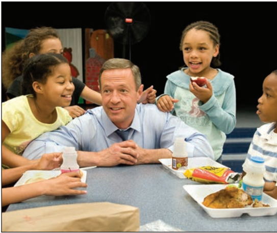
Governor O'Malley with Maryland school children