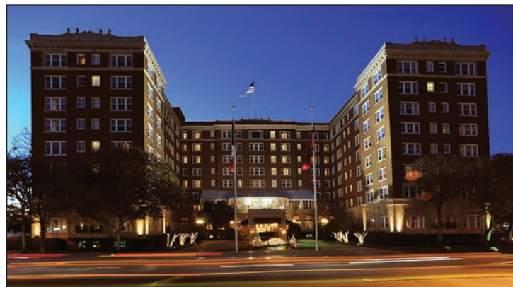
Winter Valley Warwick Resort and Spa, Dead Sea, Jordan (left); Warwick Melrose, Dallas (above)