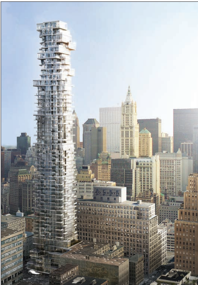
56 Leonard (above) and the entrance to The Mark (right)

completely immersed and leaving no stone unturned, you learn a lot and can make amazing things happen. We are a very hands-on company where every team member is involved from the conception of a project to its completion. Building a skyscraper is a big production. It is critical that everyone is working in-sync in order to deliver on the vision you set out to achieve.