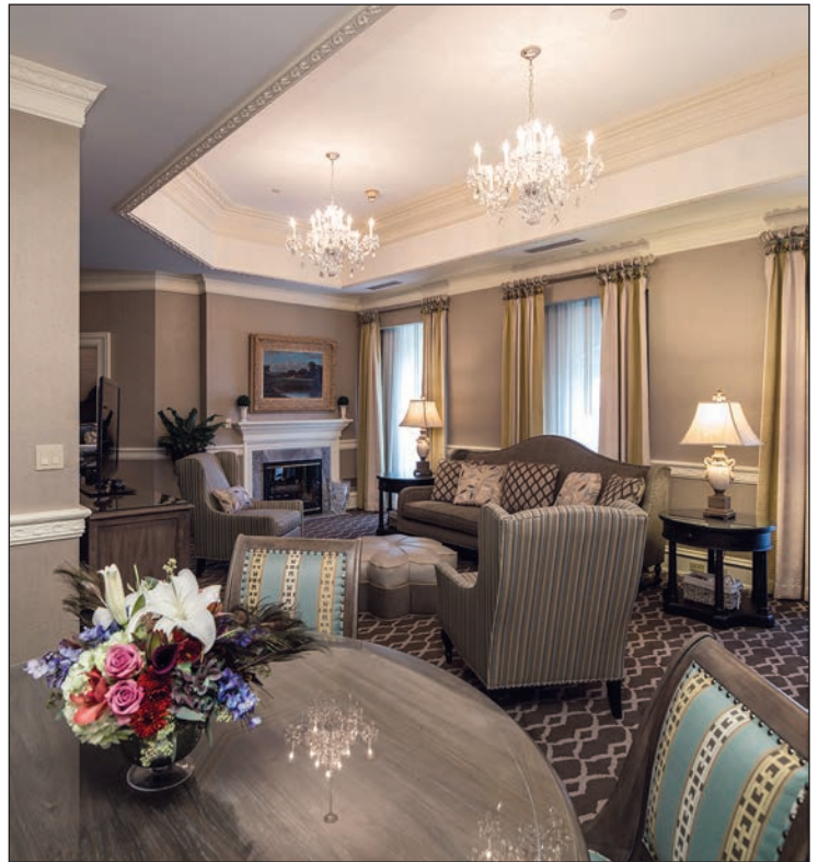
Clockwise from top left: The newly renovated Presidential Suite living and dining area; the suite's lobby; living and dining area with fireplace; bedroom; and bathroom

The suite's new look boasts a modern, European feel while remaining true to the architecture and interior design of the Chateau Lafayette, and it's sure to delight any well-heeled traveler. ●