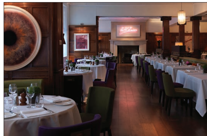
Dover Suite bedroom (left); HIX Mayfair Restaurant (above)