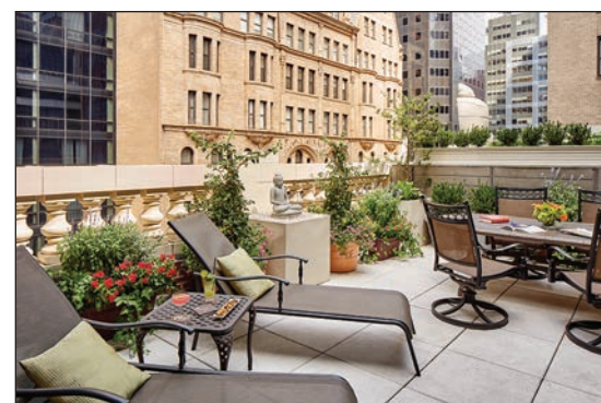
Clockwise from top left: Producer Suite living area and dining room; Director Suite living area; Sanctuary Suite with terrace; Zen Suite terrace; Chatwal Suite terrace; Ruby Suite bedroom and terrace