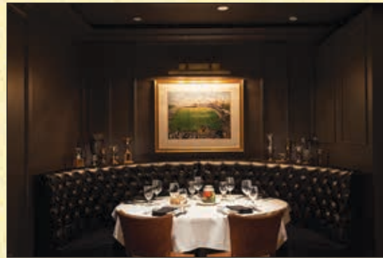
Omni Berkshire Place entrance (top); a booth at Bob's Steak and Chop House and Bar (above); breathtaking views from the terrace of an Omni Berkshire Place suite (lower left); Fifth Avenue Suite 1922 Parlor (lower right)

Chop House and Bar. Bob's is recognized as Dallas' #1 steakhouse and offers an authentic dining experience featuring prime steak and seafood, decadent desserts and oversized cocktails