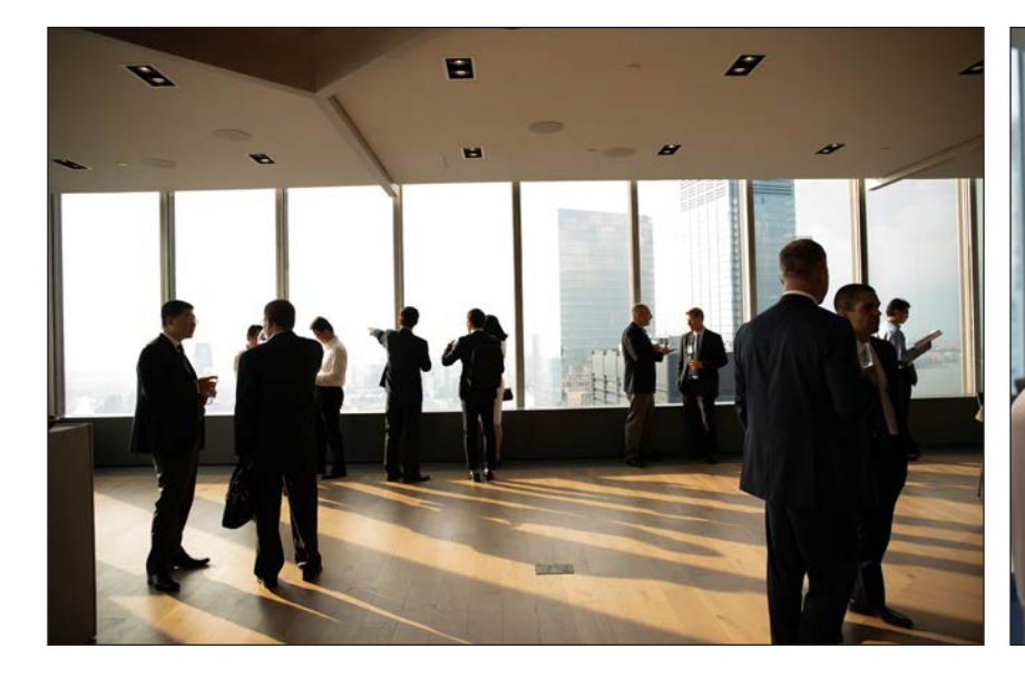
Views from the Bay Room on the 60th floor of the Fosun building