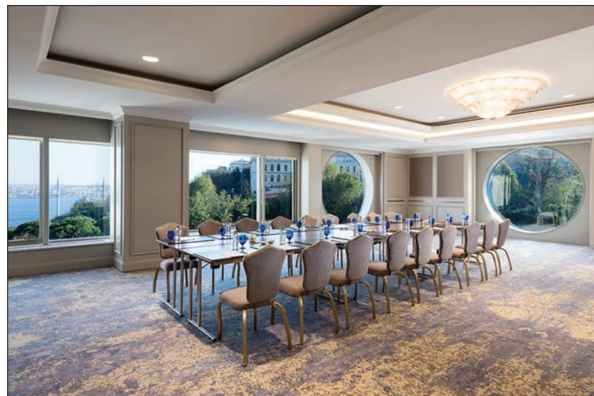
Istanbul Luxury - 89