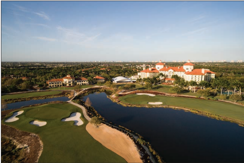
Employees First - 93