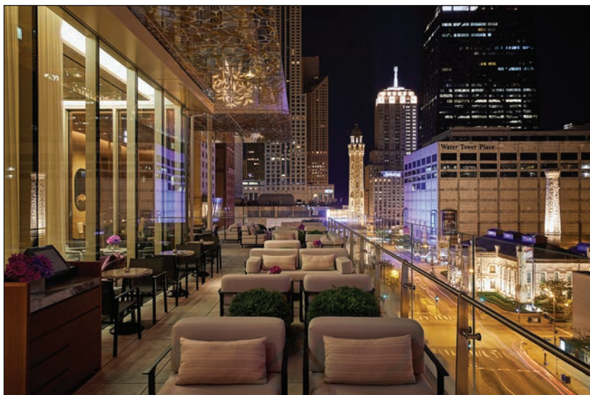
Creating an Immersive Experience - 88