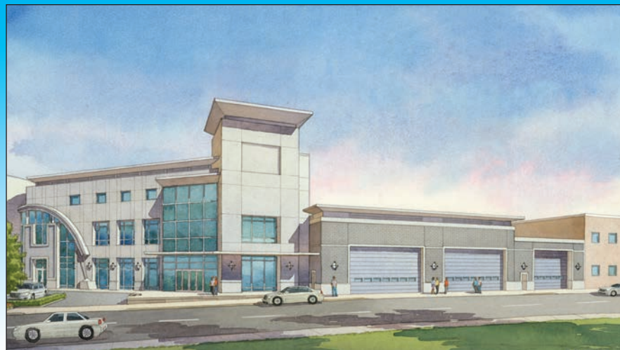
Potamkin's East Harlem development is a state-of-the-art, environmentally-conscious fleet maintenance facility that integrates seamlessly into the neighborhood and minimizes impact on the community.