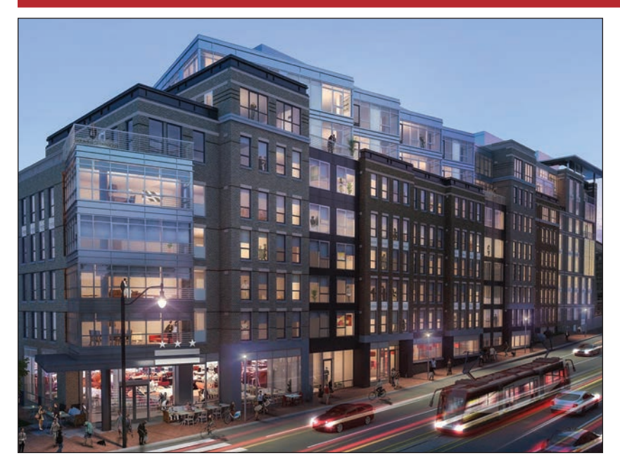
Station House in Washington, D.C.