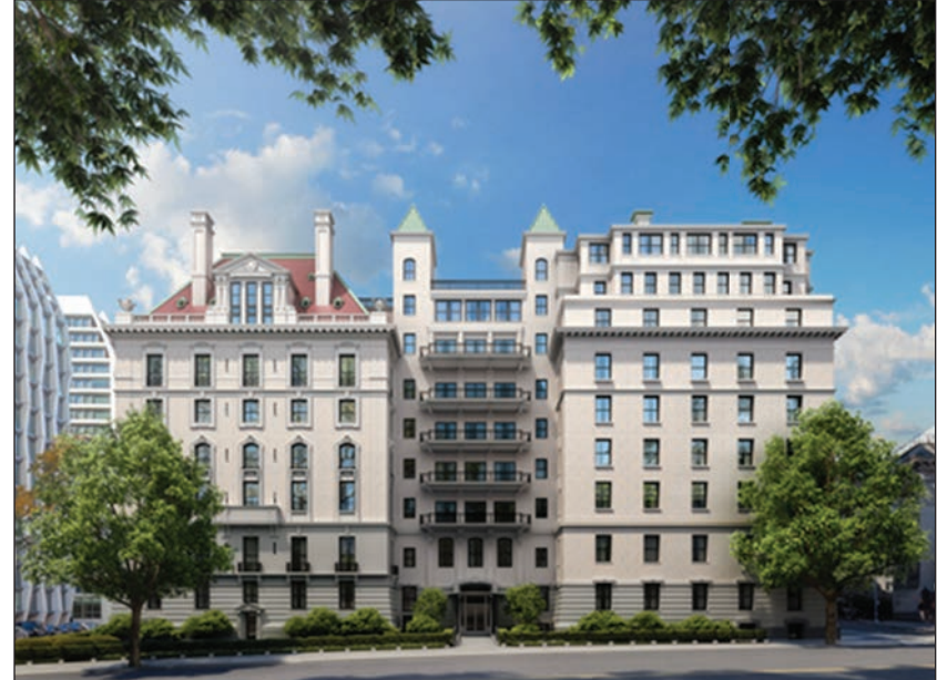
30 Morningside Drive