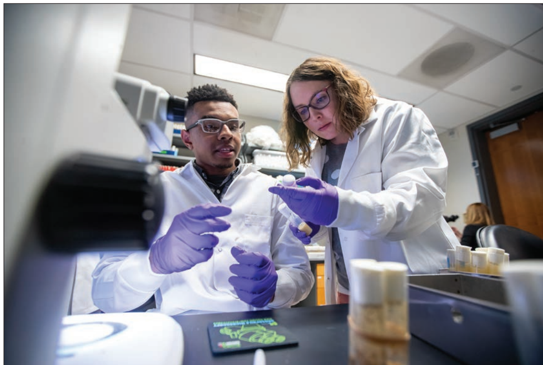
Research being conducted in the Kate O'Connor-Giles Lab

Research is essential to everything we do. If you're an institution that is dedicated to advancing knowledge through research and education, and also that understands and appreciates how they work together to benefit society, that makes for a great research university.