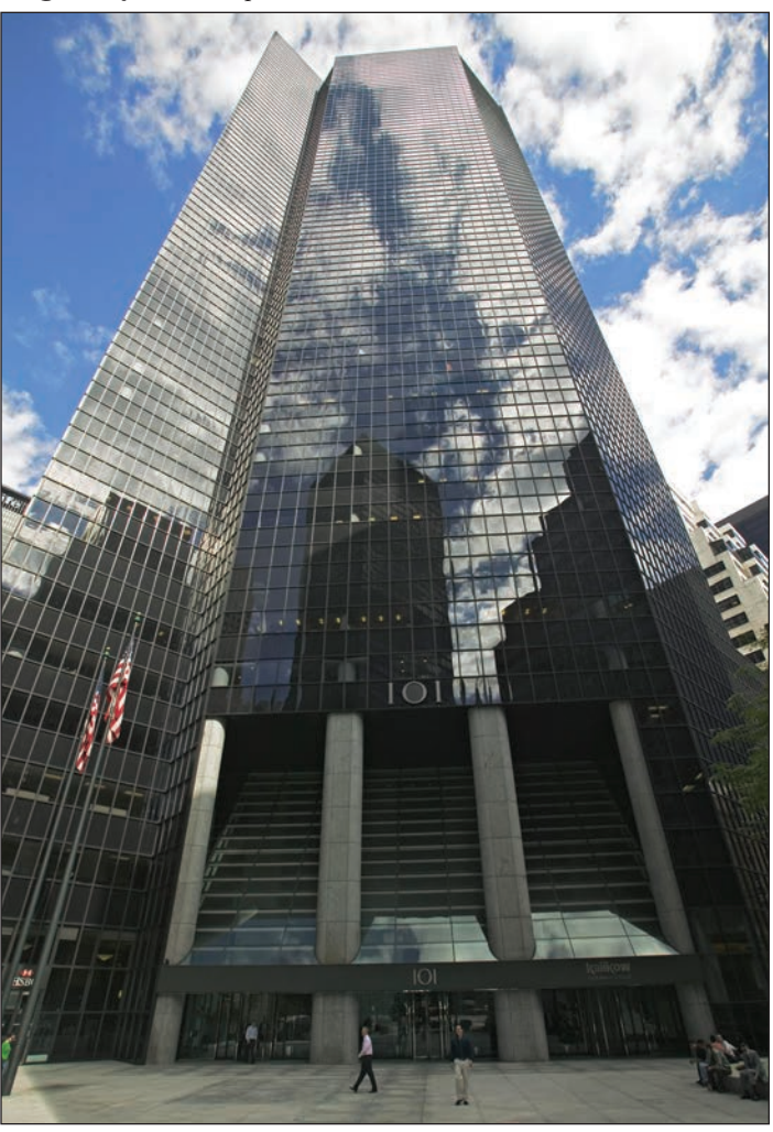
101 Park Avenue

I tell you, I really hope it will be about both. I continue to thoroughly enjoy business – it keeps me focused and engaged. It is the business that has given me the good fortune to give back to the philanthropic endeavors. \bullet