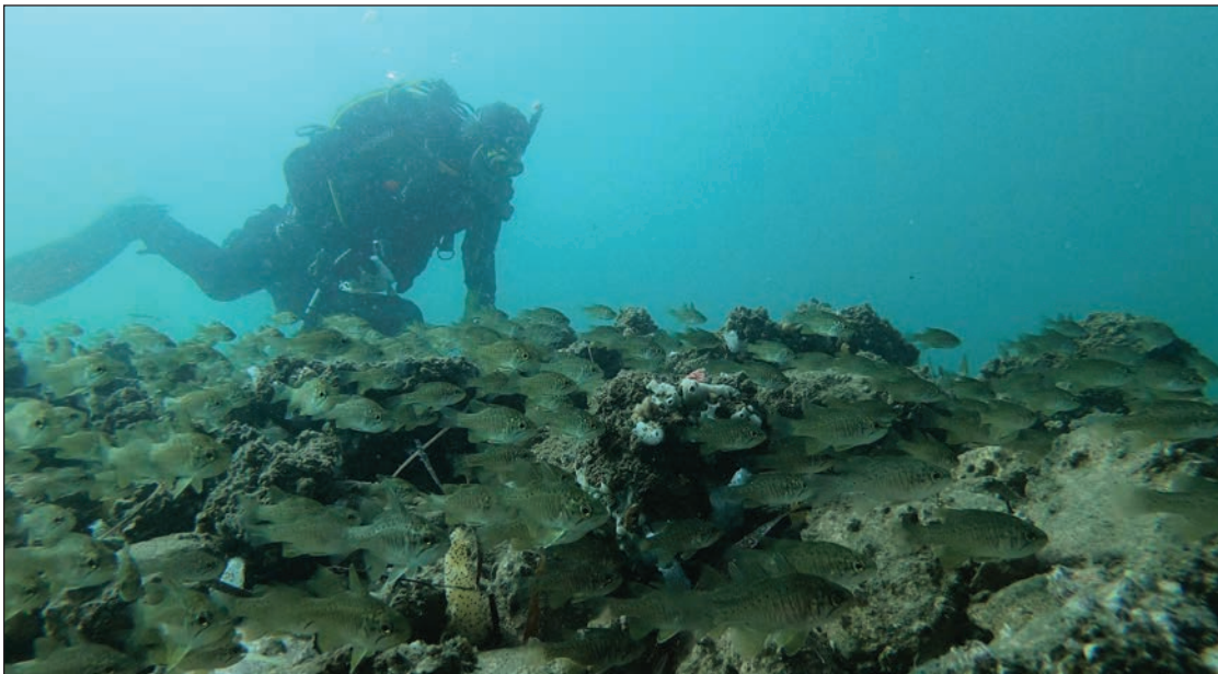
School of Gobblegut fish at TNC built shellfish reef at Oyster Harbour, Albany, Western Australia. The oyster reef was built in November/December 2019. Today, a great variety of marine life and fish can be seen around the reef.

We know that our mission is more important now than ever before. That's why we're tapping into new sources of capital, like impact investment and debt restructuring, that can maximize the impact of traditional philanthropy to fund conservation that also supports local economies. One example of this work is Blue Bonds for Conservation, an approach which focuses on island and coastal nations who are particularly vulnerable to climate change and rely on healthy marine ecosystems for their local economies and protection from storms. Blue Bonds for Conservation leverages up-front philanthropy to restructure sovereign debt in exchange for a countries' commitment to reinvest in natural resources by protecting as much as 30 percent or more of its near-shore ocean areas. The savings then helps the country create marine protected areas and fund conservation work that balances the needs of nature and people, leading to sustainable economic opportunities for all partners involved. In 2016, TNC worked with the Republic of Seychelles on this kind of debt restructure and to date the government has established marine protected areas twice the size of Great Britain.