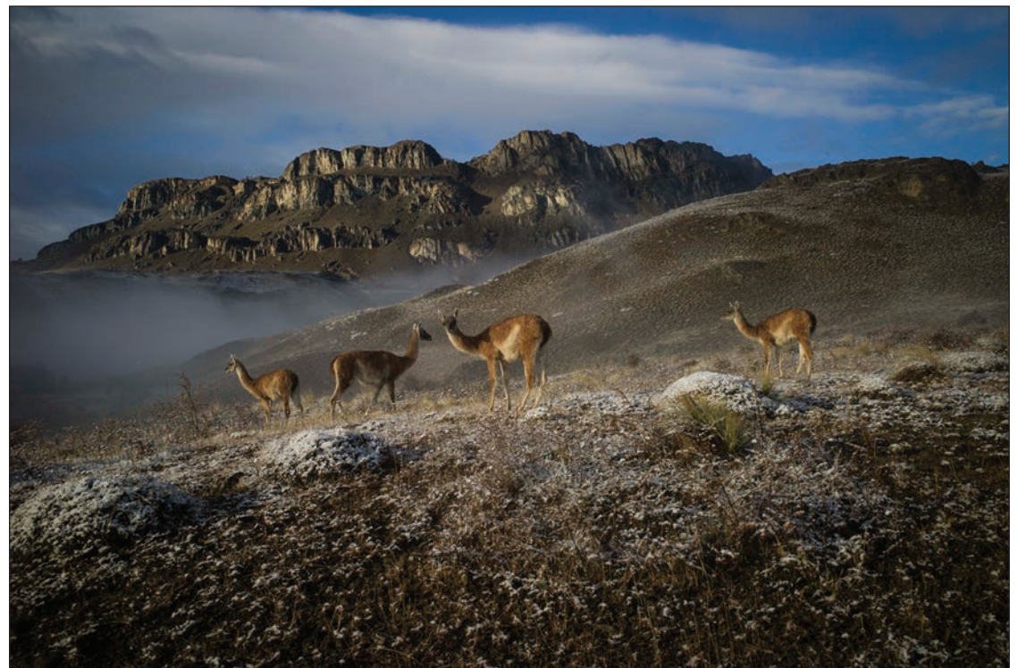
Guanacos at sunrise in Patagonia National Park, created with the donation of land by Tompkins Conservation in 2018. This native camelid used to roam the Patagonian steppe in great numbers. While its population has been largely reduced and displaced by ranching, the Chacabuco Valley in the National Park is home to thousands.

For many years I spoke at leading business schools in the United States – Wharton, Stanford and others. At the end of every session, someone in the class would ask me what I would do if I were them and I always said the same thing. When I was young, just starting out in business, we didn't know what we know today – we didn't know that ecological systems were central to the well-being of all life. It was easier then. Your problem now is that you do know what's going on. Once you know something, you cannot turn your back to it – this is the challenge for young people today. If you make the wrong decisions about what to do with your life, you do so knowingly and this forces you to take long hard looks at yourself in the mirror. At this particular moment, the extenuating circumstance is so extreme that we must all do whatever is required to take care of ourselves in terms of daily life, but also use this time to think deeply about what is happening to us and, more importantly, why it is happening. We will do no good for ourselves or anyone else if we do not have the presence of mind to think deeply about the pandemic, our deep social unrest, the onslaught of our changing climate and the extinction crisis. We are far past the time when sitting on the sidelines is an option. ●