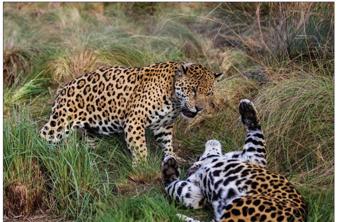
Jaguars getting to know each other before mating at the Jaguar Reproduction Center on San Alonso Island in the Ibera Wetlands. So far, two cubs have been born at the Center. They will be released in 2021 along with other rescued jaguars to form a foundational population for this top predator, extinct in the wetlands for 70 years, and eventually play a role in the region's emerging economy of nature-based tourism.

Will you discuss your thoughts on the role of biodiversity and its links to public health?