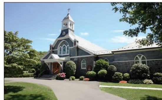
Saint John the Evangelist, Darien, Connecticut