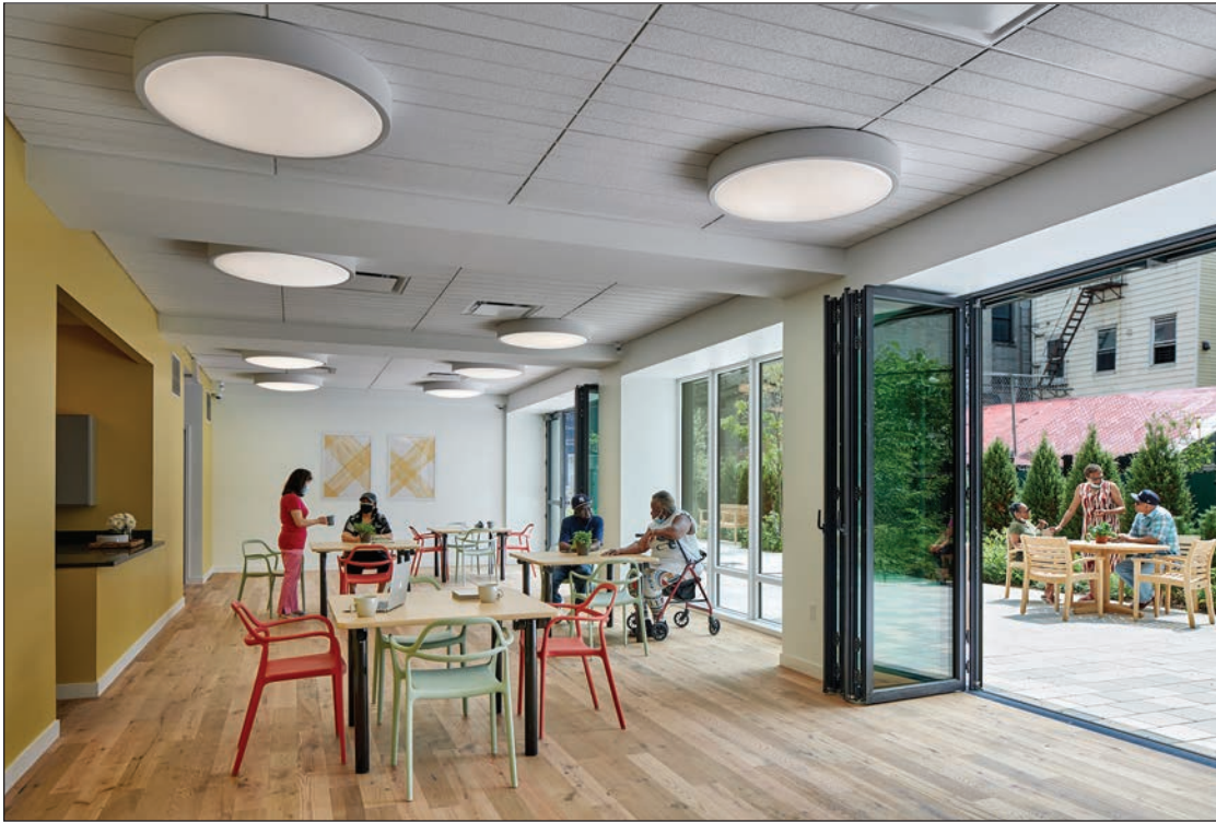
A community room at East Clarke Place Senior Residence

wealth, whether through home ownership or a career that allows our clients to earn meaningful wages – or even build their own business. On that note, we’re very excited about our latest proactive response to the dual homelessness and aging crises: East Clarke Place Senior Residence, our recently opened, $68 million, 14-story, 122-unit housing facility for low-income and chronically homeless seniors. It’s the result of a partnership between the public, private, and nonprofit sectors created to meet the growing demand for affordable housing for older adults.