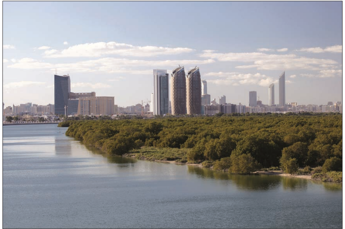
Another aspect of EAD's mission is to protect the air quality of Abu Dhabi

One of the main keys to protect and preserve natural resources is through an in-depth understanding of how both the natural and anthropogenic systems of Abu Dhabi function and interact with each other. As we know, most of the current environmental challenges are outcomes of how we have used and interacted with our environment.