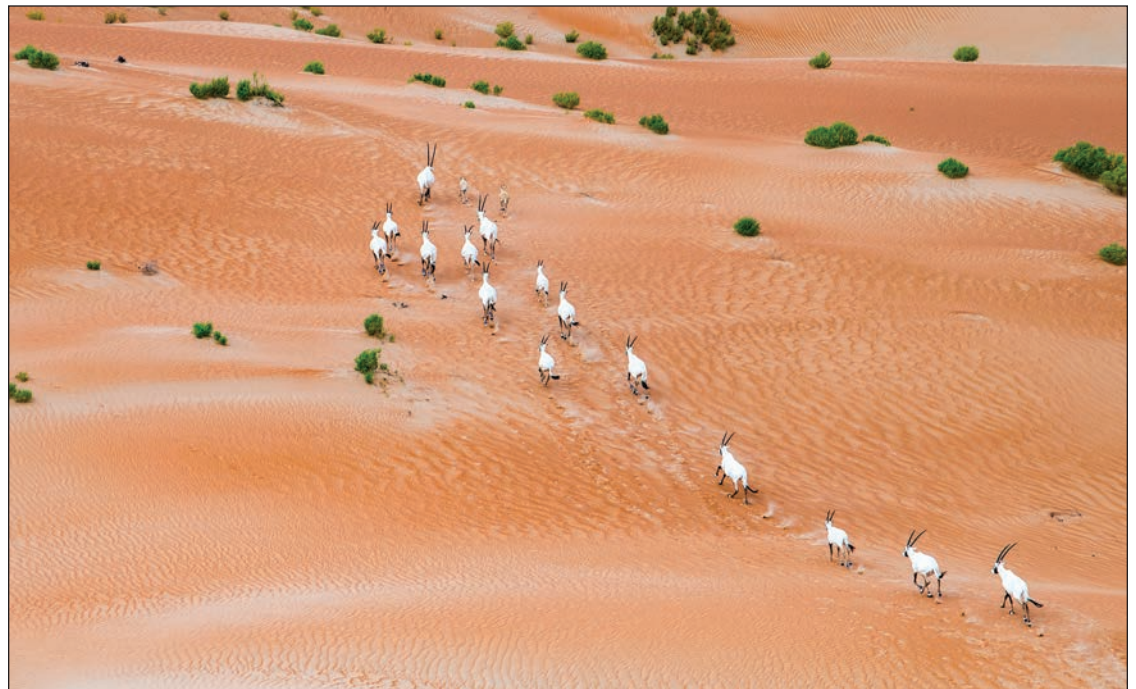
EAD monitors a wide variety of biodiversity in the emirates, including the Arabian Oryx show above

AGENCY BRIEF Established in 1996, the Environment Agency – Abu Dhabi (EAD) is committed to protecting and enhancing air quality, groundwater as well as the biodiversity of Abu Dhabi's desert and marine ecosystem. By partnering with other government entities, the private sector, NGOs and global environmental agencies, it embraces international best practice, innovation and hard work to institute effective policy measures. EAD (ead.gov.ae) seeks to raise environmental awareness, facilitate sustainable development and ensure environmental issues remain a top priority on the Abu Dhabi national agenda.