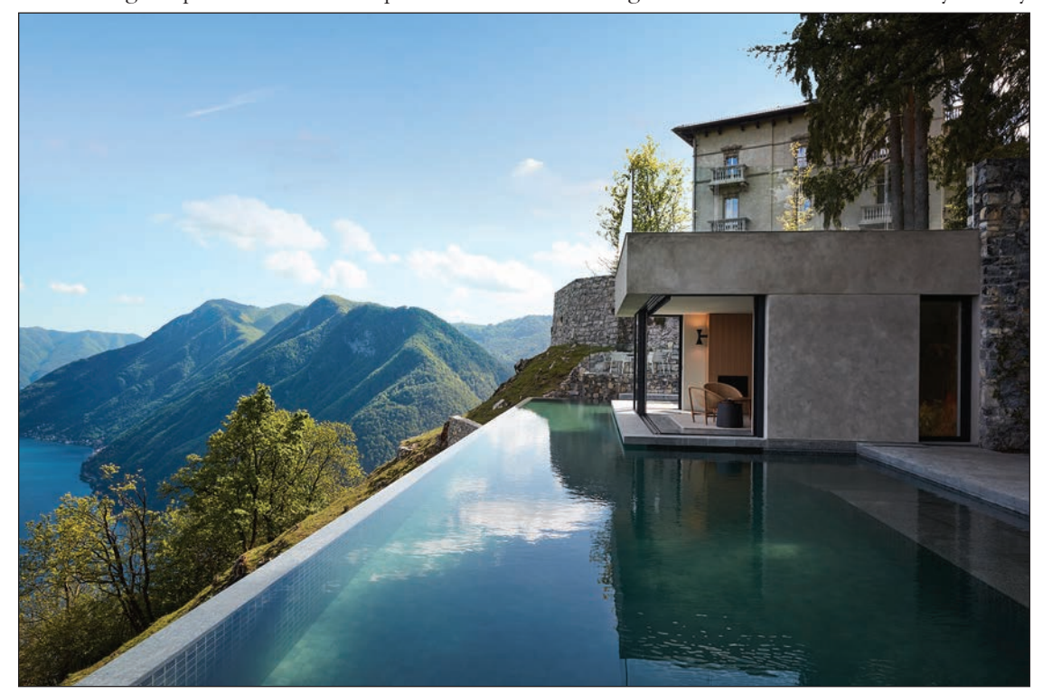
A few of StayOne's luxury rentals throughout the world (above and following page)

The disruption to international travel meant that we faced greater uncertainty and risk in demand due to limited travel across borders. Throughout this time, we have adapted to the needs and trends of our community which led to significant increase in inventory in key