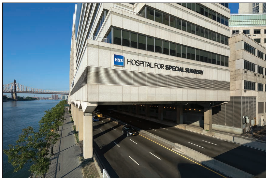
The main campus of HSS on Manhattan's Upper East Side (above and right)

HSS is dedicated to helping those around us, both in our own community and across the world. We do this through our patient care, education, innovation, and also humanitarian work. One example is the HSS Global Health initiative, which supports the delivery of care for vulnerable populations through volunteer work. Over the years, our reach has included providing orthopedic