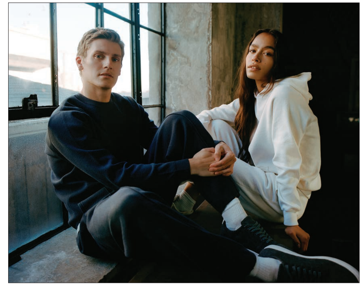
Models in NAADAM cashmere products

were inequitable circumstances that forced prices up throughout the supply chain. We felt that if we could undo or intermediate certain aspects of the supply chain that were taking advantage of people we wanted to help, we could reduce the cost of the product. The way to think about NAADAM's supply chain at the simplest form is to imagine you have a string and one side is the customer and the other side is the herder. This is the place where the process starts which is with the herder and the place where it ends which is with the customer. If you pull out the middle of the string, the two sides all of a sudden become a lot closer. In the process of making those two sides closer, the consumer begins to understand the story of where the product came from which increases the value while at the same time bringing down the cost by eliminating the inefficiency in the supply chain that was causing inequality and forcing prices up for the customer.