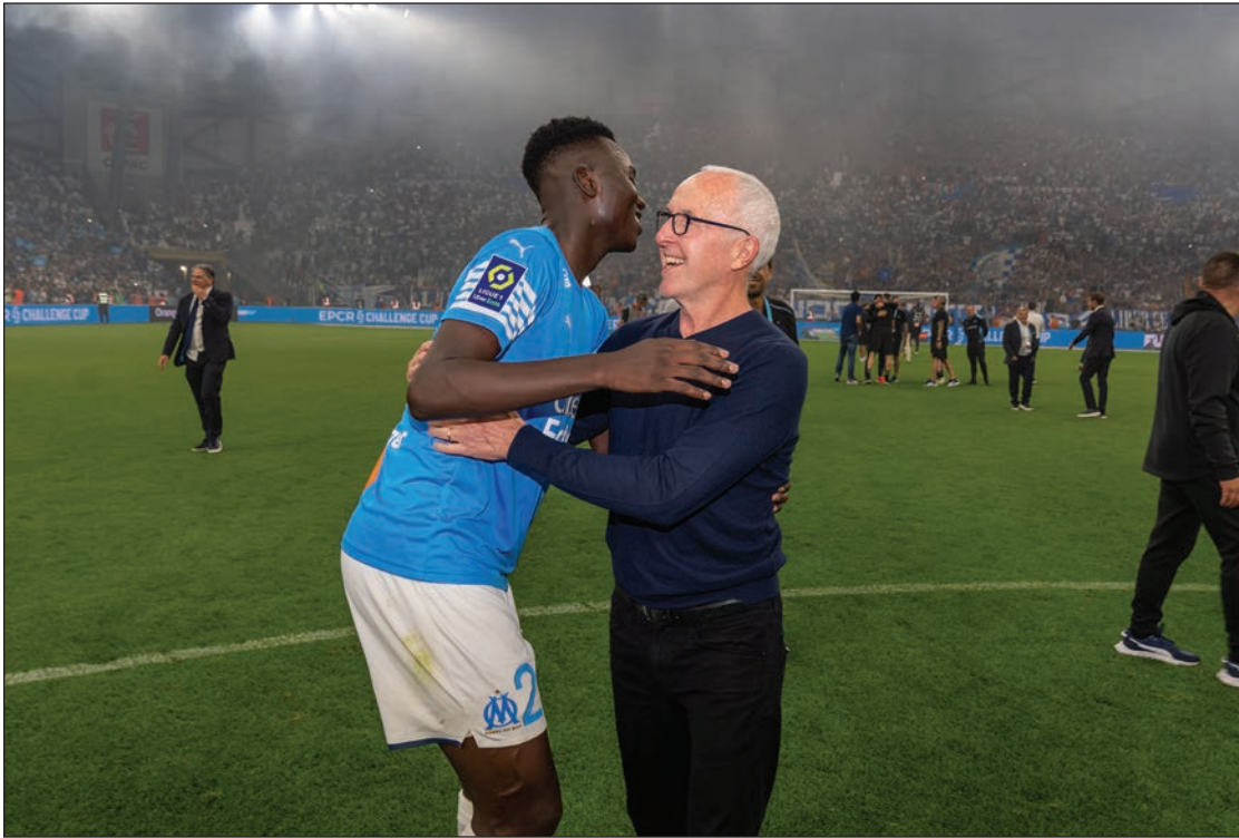
Frank McCourt celebrating a victory with Olympique de Marseille midfielder Pape Gueye

owner of the Boston Braves. In my family, the fact that he was a part owner of the Braves is a neat piece of history, but something we are much prouder of is that while he was an owner of the team, they started something called the Jimmy Fund. While the Braves left for Milwaukee in 1953 – and they are now, of course, in Atlanta – the Boston Red Sox have continued to support the Jimmy Fund since 1953. Today, the Jimmy Fund raises millions of dollars each year to support the fight against cancer.