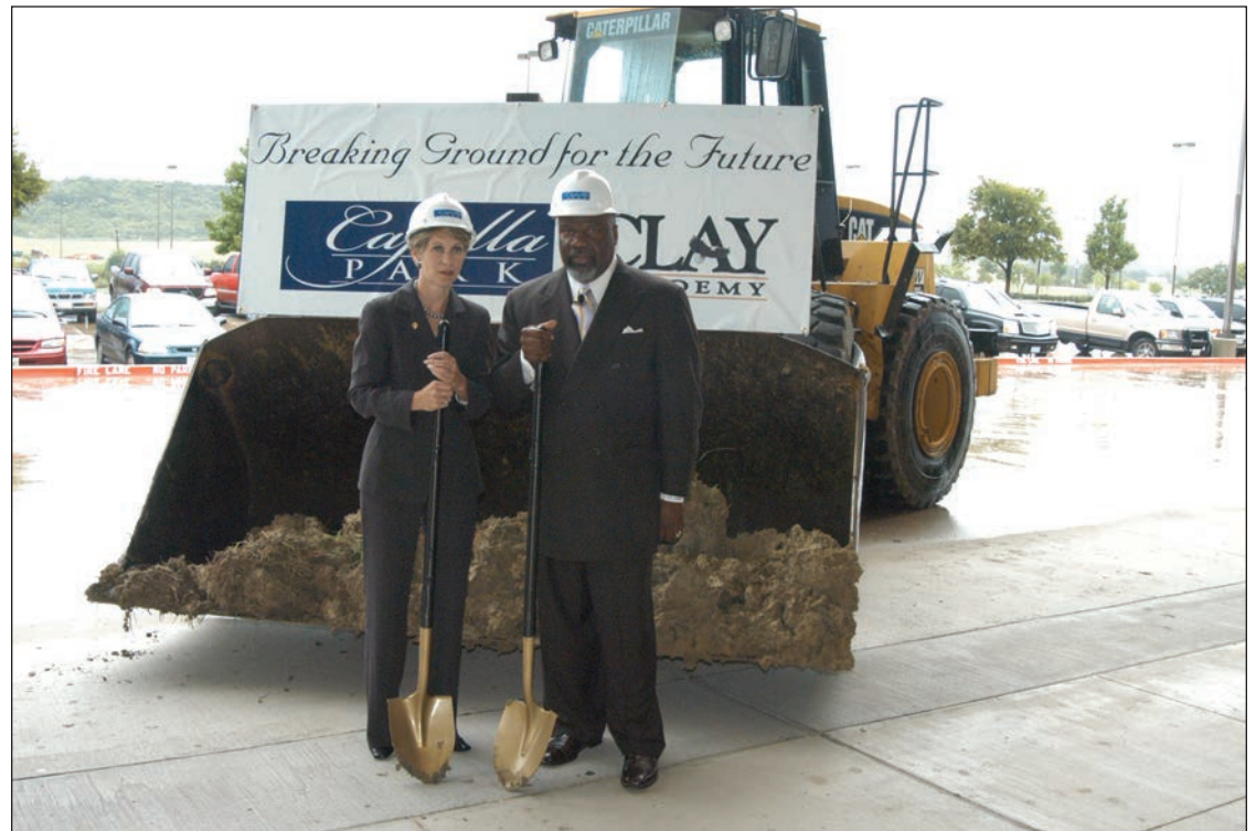
T.D. Jakes breaking ground for Clay Academy in Dallas

I mentioned earlier that we’ve lost the art of listening. Listening is critical to being a good leader, a good speaker, a good friend. Talking without listening first is a dangerous activity. That is true of everyday conversations, but it’s also true in the context of any public speaking opportunity.