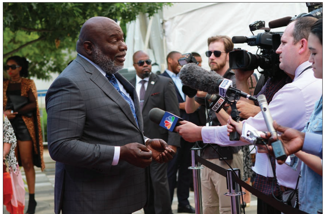
T.D. Jakes speaking to press at 2017 MegaFest

Last year, we partnered with Frito-Lay, Dallas Summer Musicals, the Moody Foundation, the Meadows Foundation, Dallas Independent School District (DISD) and iDTech to provide a Hamilton-themed STEAM program to DISD students. The program taught students how to create their own original Hamilton marketing materials, including printed posters and video trailers, using Adobe Premiere and Adobe