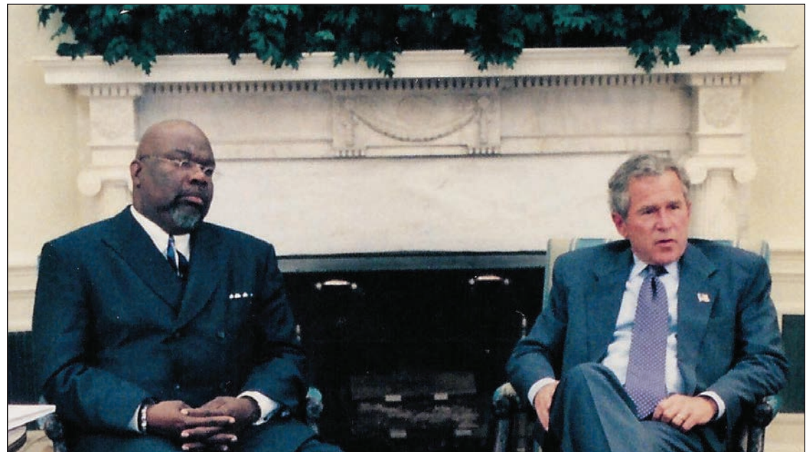
T.D. Jakes with U.S. President George W. Bush

In a very practical sense, our church strives to be the hands and feet of Jesus. And I'm talking about physically, tangibly. For us, this mission drives us to pinpoint areas where people – both here in Dallas and across the globe – need help and to create innovative solutions to address these issues.