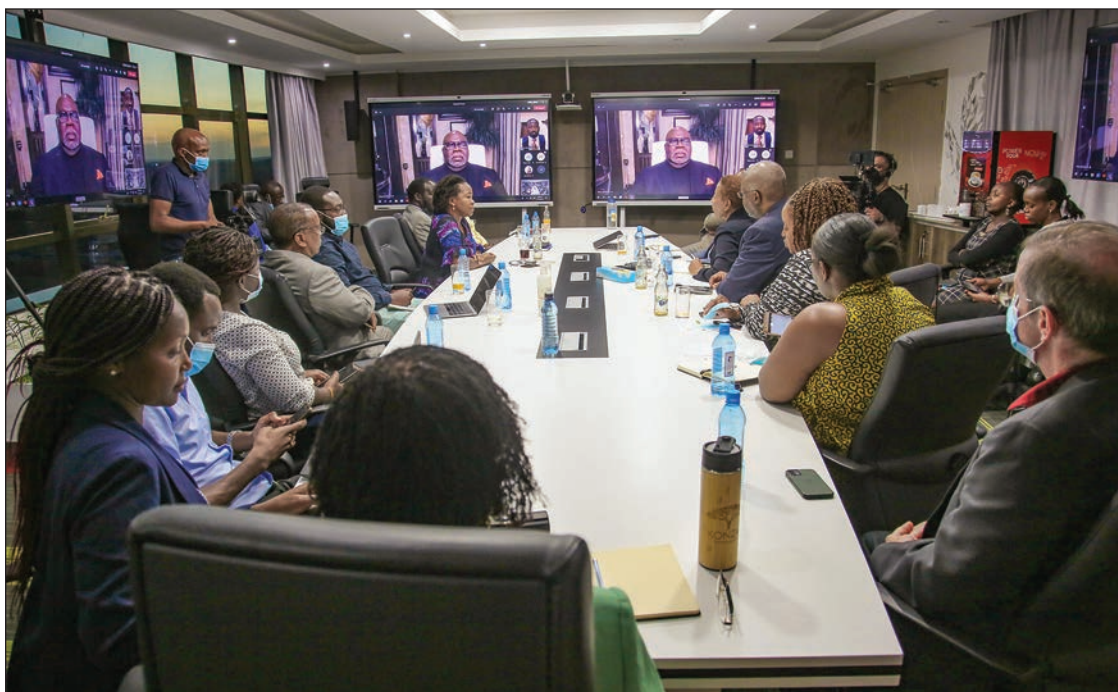
T.D. Jakes speaking to Kenyan business leaders in 2021

To that end, I have found myself very inspired by the young people I see in the world today speaking out and demanding change. They are concerned about many