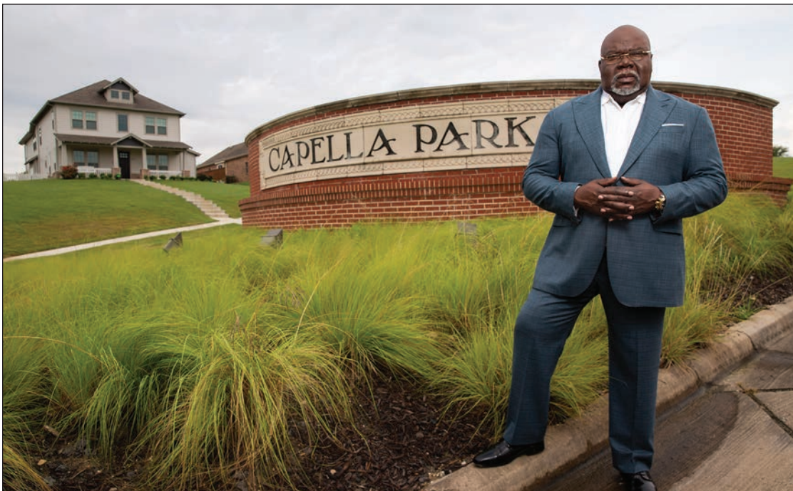
T.D. Jakes at Capella Park, a residential community near The Potter’s House in Dallas, Texas

Here’s to the next 45, and the next after that! I may not be here to see it all, but I know the future is in good hands. ●