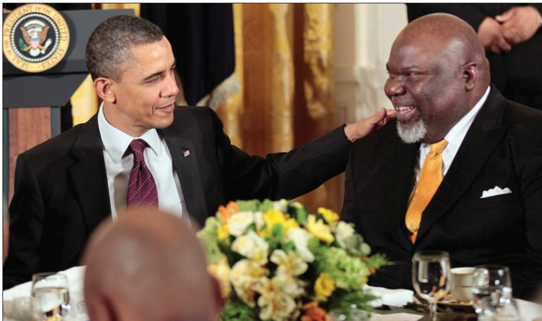
U.S. President Barack Obama with T.D. Jakes

Named “America’s Treasure” by Oprah Winfrey, Jakes is a master communicator for all ages. He offers a collection of award-winning and New York Times best-selling books, including Destiny: Step Into Your Purpose , and Instinct: The Power to Unleash Your Inborn Drive . In the entertainment space, Jakes has numerous film credits to his name, including the award-winning romantic comedy, Jumping the Broom , among others.