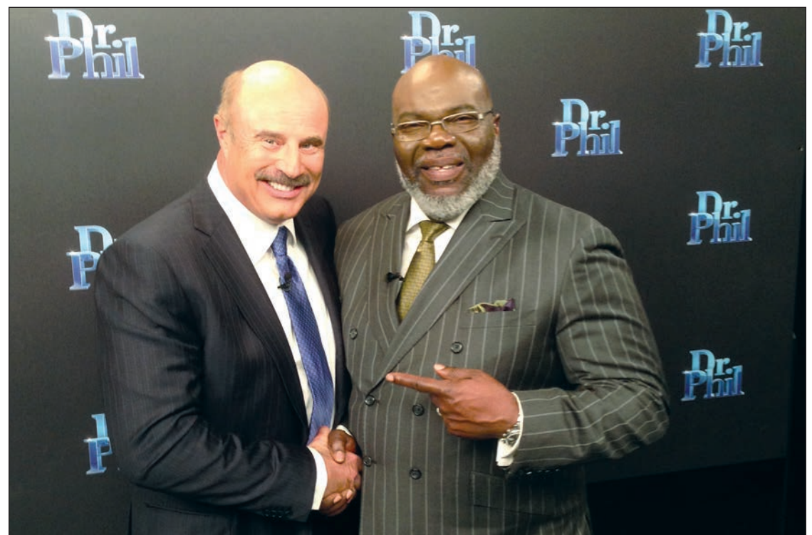
Dr. Phil McGraw with T.D. Jakes

I believe that much of effective leadership is instinctual. We instinctively know how to lead if we allow ourselves. While there are certain qualities and traits that a person can be born with that might make him or her more of a natural leader, I do believe everyone can lead, and everyone can learn how to be a more effective leader.