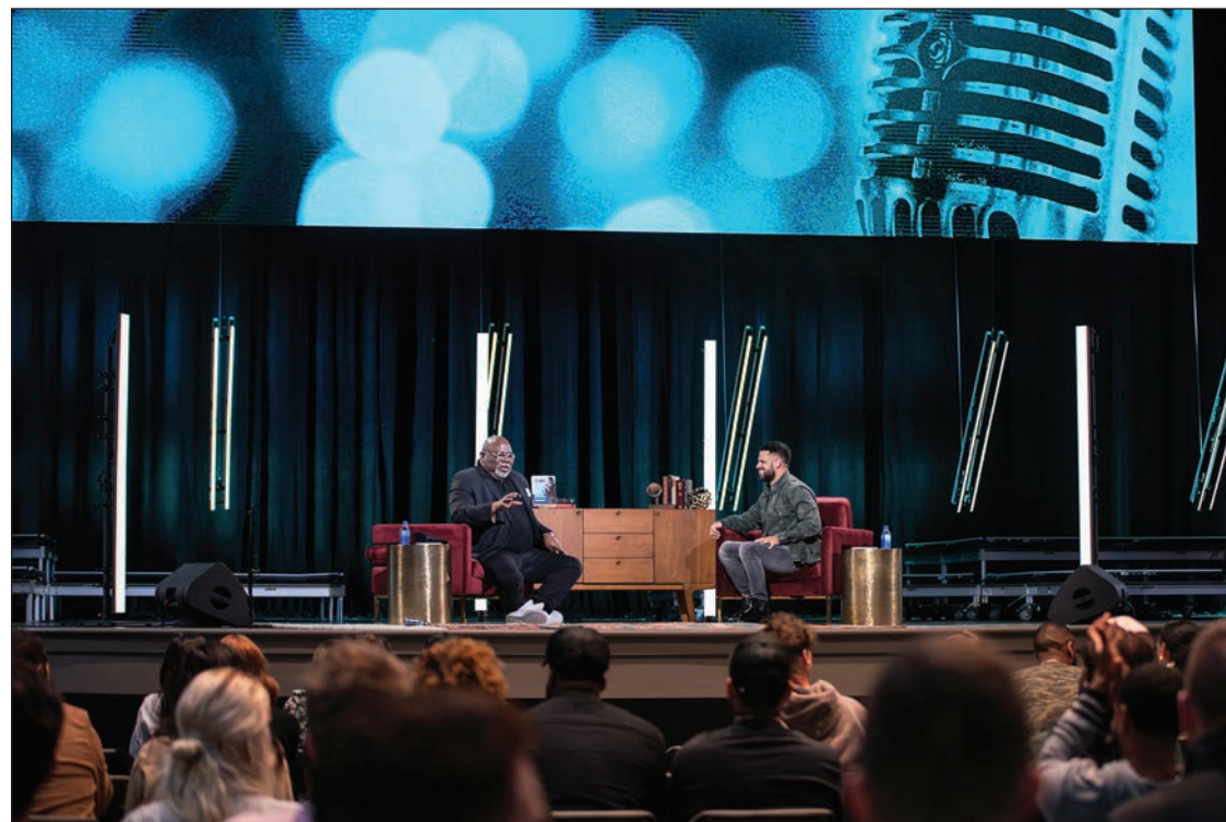
T.D. Jakes speaking with Steven Furtick

This is not a country of red and blue states, it's a country of mothers and fathers, of sisters and brothers. Despite our many differences, we all want the same things at the end of the day – a comfortable place to call home, the