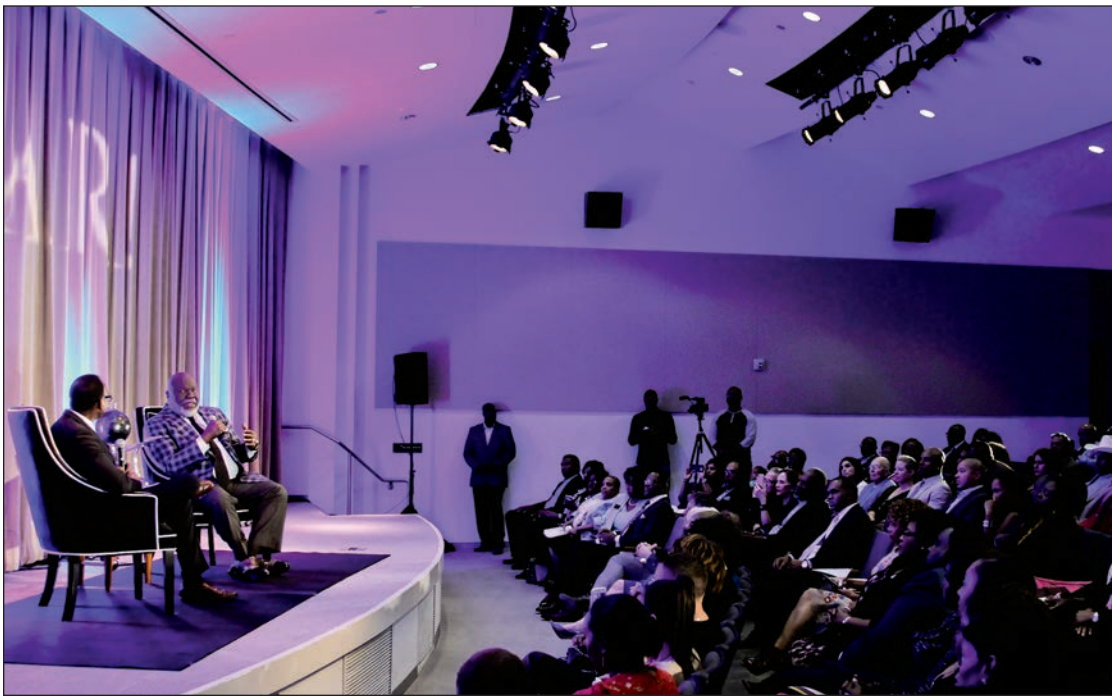
T.D. Jakes speaking to a crowd at Frontiers of Flight Museum

Photoshop. The iDTEch staff provided detailed lessons on the Adobe software programs at the beginning of each session, and Dallas Summer Musicals teaching artists provided a connection to theatre and to Hamilton, with a focus on cultural awareness and racial equity.