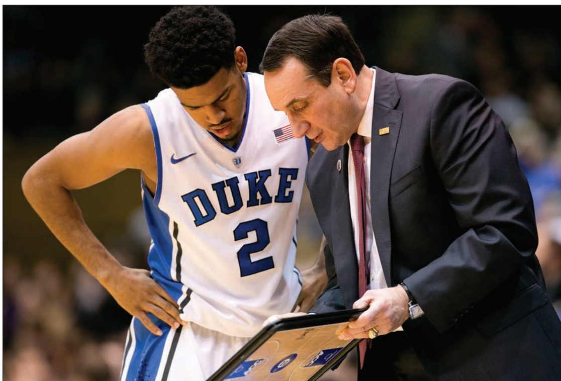
Coach K during a Duke victory at Furman in 2014

reasons, but all of them had mothers. I always looked at the relationship the young man had with his mom.