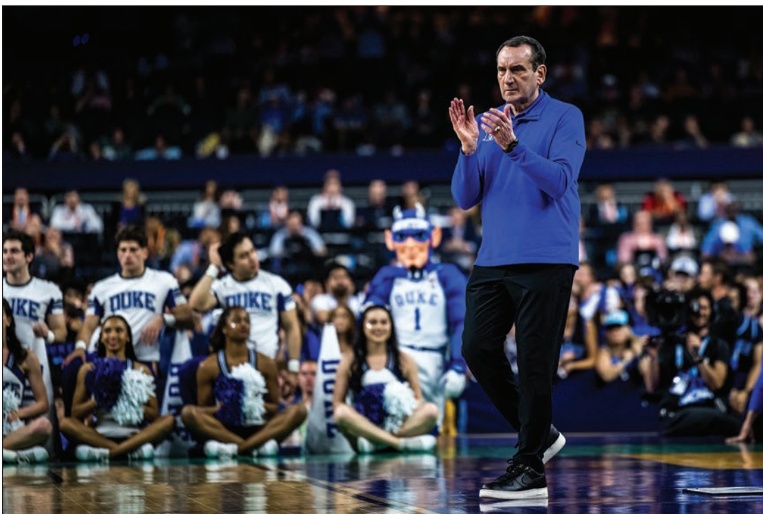
Coach K at the 2022 Final Four (above) and as a young coach at Duke (upper right)

We look at three things when recruiting and they are all equal: obviously talent at the highest level; the fit into the environment, whether that was during my time at West Point or at Duke; and character – we studied the character of each of the young men we recruited, looking at how they treated their teammates, how they responded to their coach, teacher evaluations, etc. Almost half of the men we recruited did not have fathers in their lives for a number of