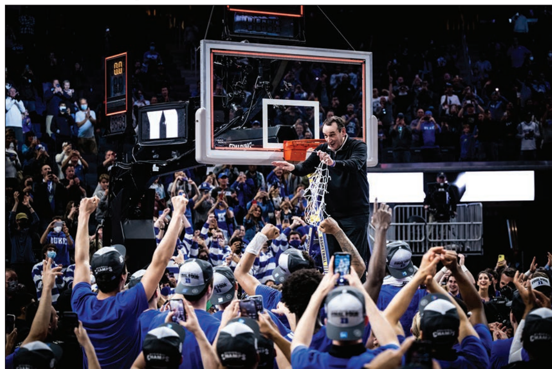
Coach K celebrating a victory over Arkansas to move into the Final Four in 2022

The NCAA has not adapted in its entire existence. Some of that consistency is good, but it has not adapted to the changes that have taken place and they need to have rules that fit for different sports and different situations. The NCAA is like the store where one size fits all, and that does not work since one size does not fit all. There needs to be an evaluation of what