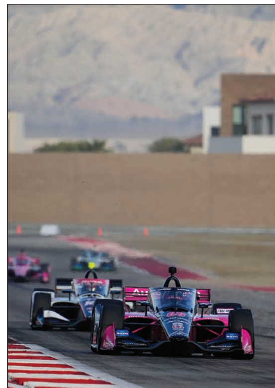
Helio Castroneves driving the #06 Meyer Shank Racing Honda