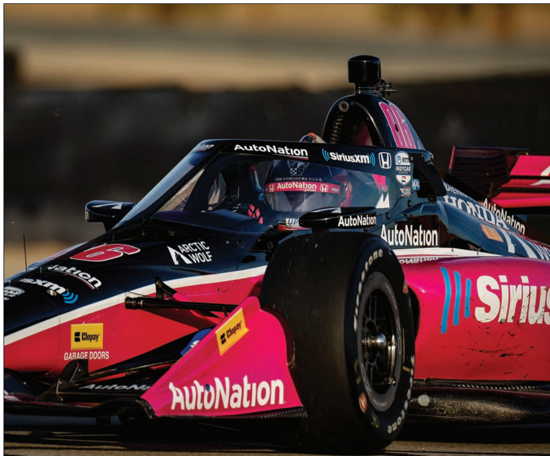
Helio Castroneves behind the wheel of the #06 Meyer Shank Racing Honda

Castroneves: I always make sure that the people on our team are well recognized. I have the opportunity to represent the team and to be a spokesperson on their behalf, but without the preparation and the expertise of every member on the team, it is not possible to be successful. This is a team sport, and as a driver you are representing the team.