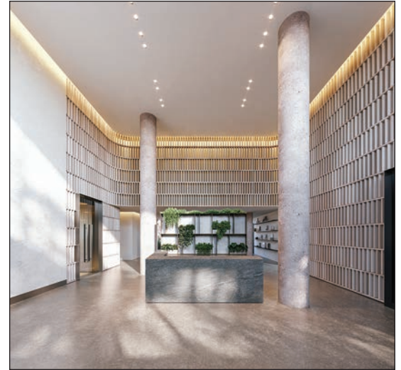
The lobby of 110 North 1st

(edredevelopment.com) is a vertically integrated real estate company handling every aspect of projects, from underwriting, acquisition, funding and investment, through architectural design, construction and development management. Based in New York City, the firm specializes in ground-up development projects located in prime locations throughout the city with a focus on Brooklyn's condo markets. The firm leverages its experience in architecture, design, financial structuring, and construction management to bring meaningful value to its projects. EDRE's strategy for every project is to use creative thinking and innovative design to overcome financial hurdles with a focus on introducing new, yet responsible, ideas resulting exceptional living environments.