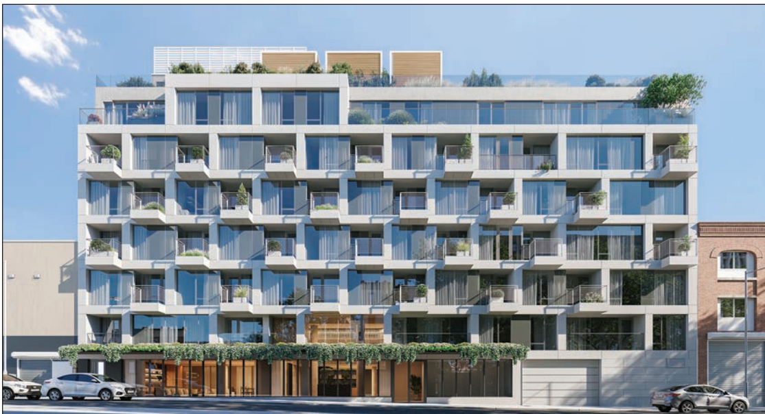
Edery_EDRE Exterior of 110 North 1st in Brooklyn, and EDRE development

I'd like to keep the same mindset of not cutting corners, as well as learning and educating our team about new ways to make living better and suitable for the changes in society. ●