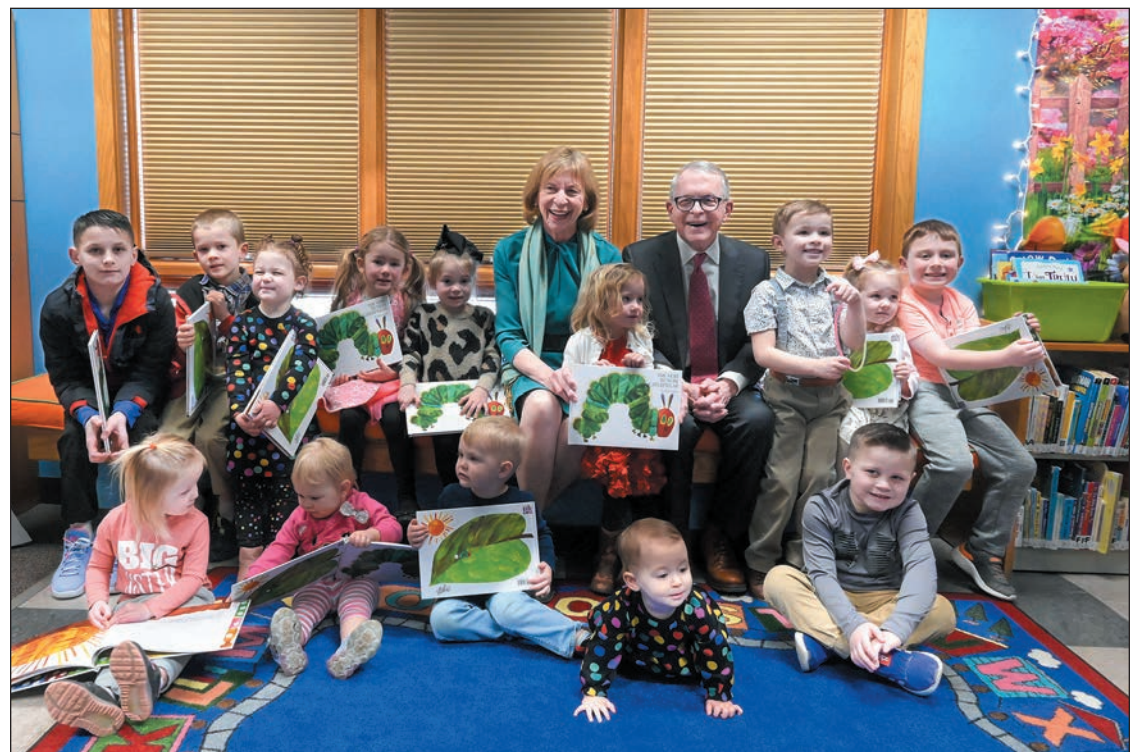
First Lady Fran DeWine and Governor Mike DeWine pose with local children from Malvern during a reading of The Very Hungry Caterpillar at the Carroll County Public Library to promote enrollment in Dolly Parton's Imagination Library of Ohio

Having access to the internet has become an absolute necessity for living and thriving in today's world, but unfortunately, reliable, low-cost connections are lacking in many communities throughout