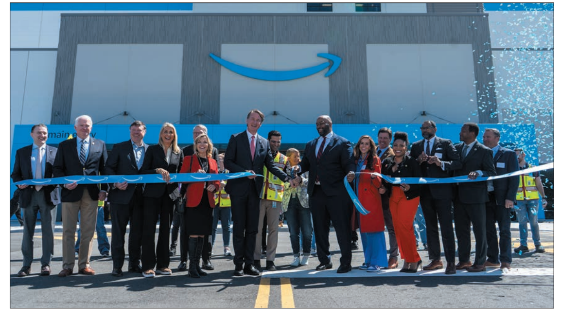
Governor Youngkin at the grand opening event for an Amazon facility in Richmond

In 2019 and 2020, Virginia was ranked 47th in the country for youth mental health support, and the situation worsened with the pandemic. That's why we needed a plan to address the crisis and offer help before, during, and after a