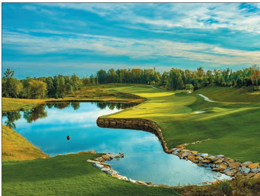
Nemacolin's second Pete Dye-designed course, Shepherd's Rock