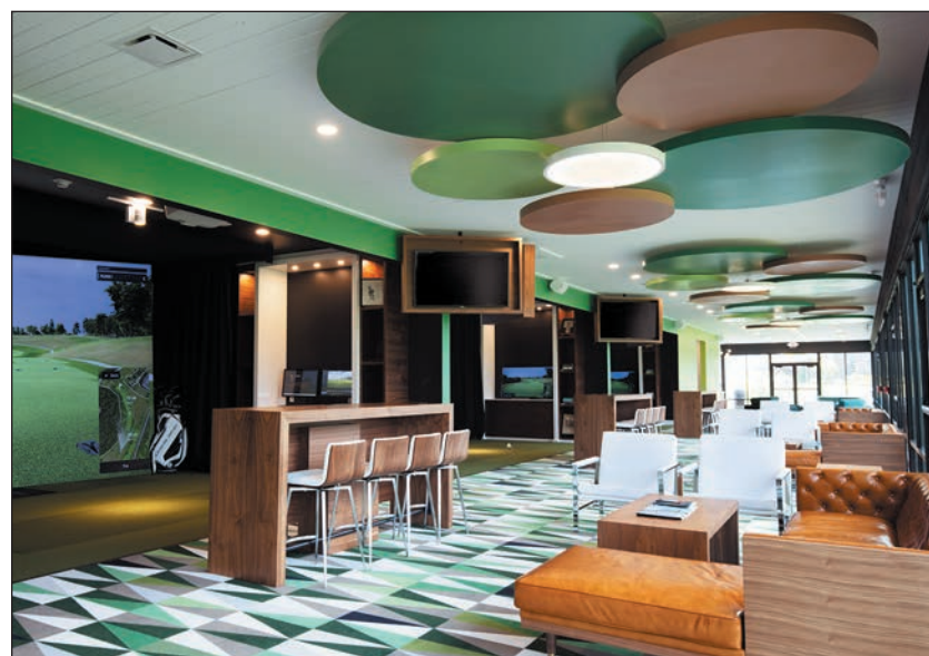
Nemacolin Golf Academy (above and below)