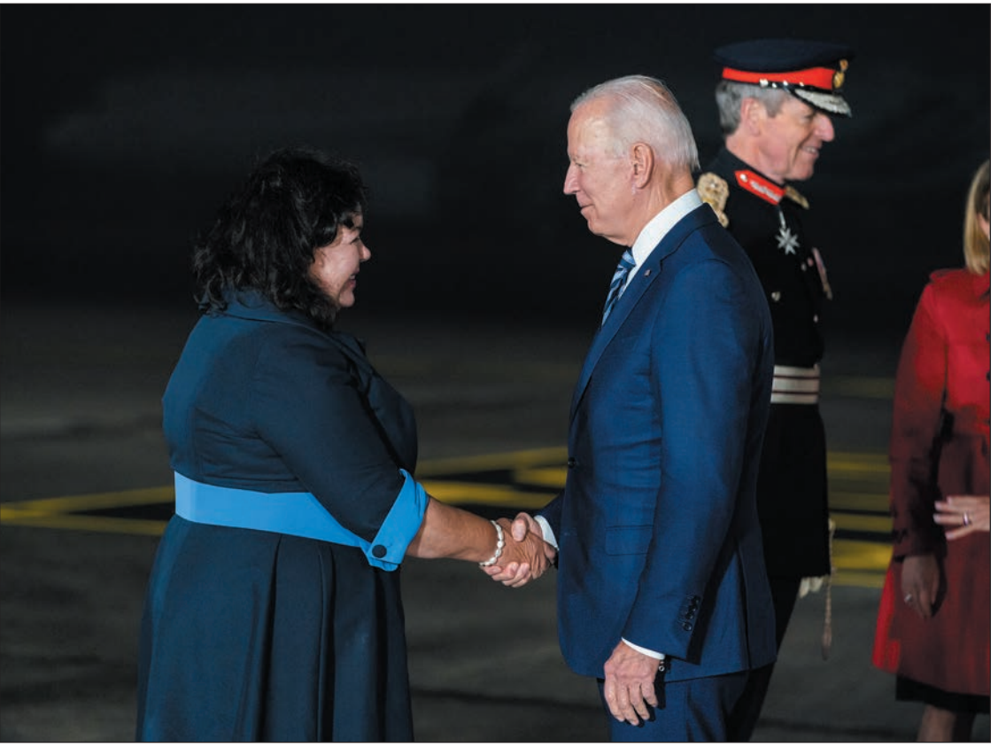
U.S. President Joe Biden and First Lady Jill Biden disembark Air Force One and greet officials at Cornwall Airport Newquay, England on Wednesday, June 9, 2021, before proceeding through a military bonor guard cordon

The U.K. plays a crucial role in the global economy. We are the number one globally connected economy in the G20, the sixth largest economy in the world, third in the world for