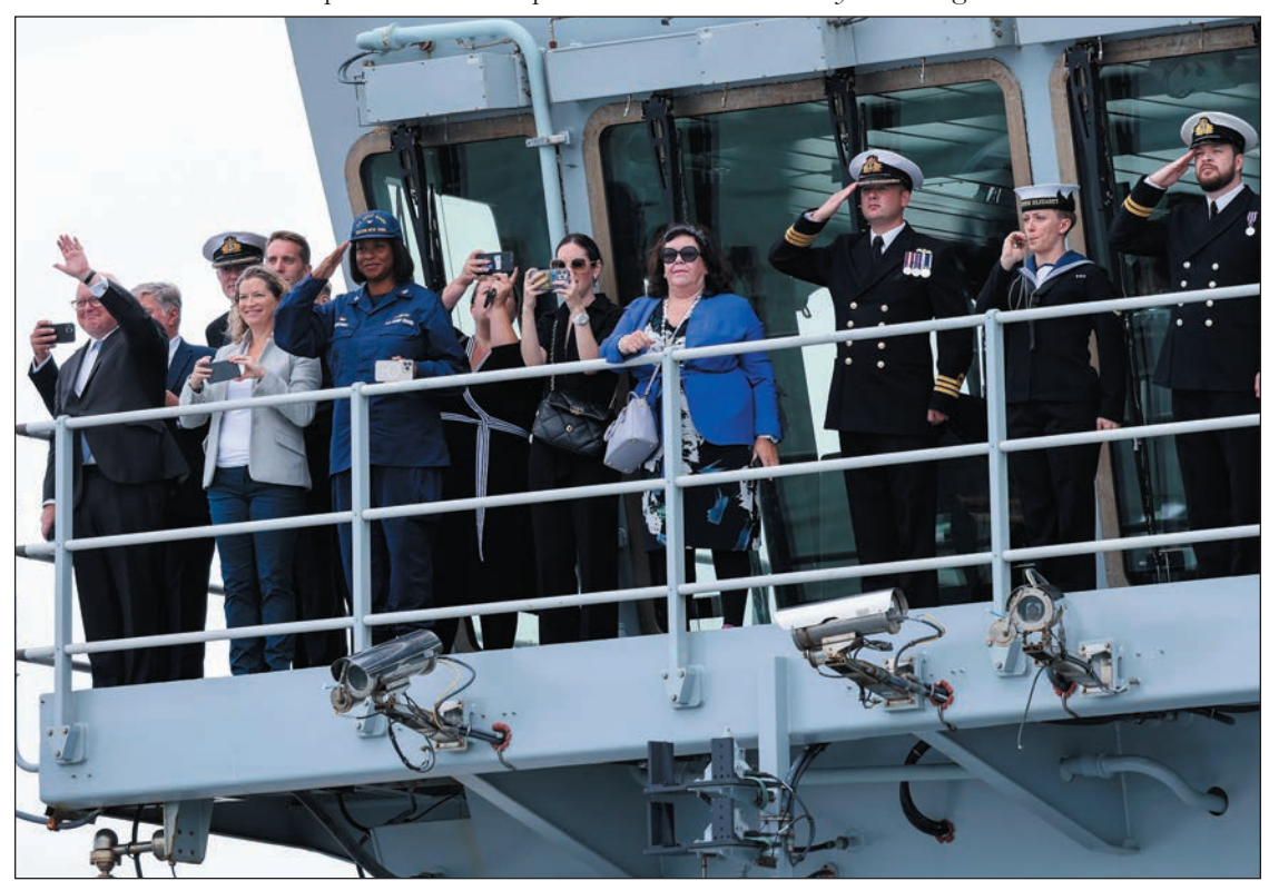
HMS Queen Elizabeth arrives in New York on September 25, 2022 ahead of bosting the Atlantic Future Forum (AFF22). The Nation's Flagship was followed up the Hudson to the heart of the USA's most populous city by its escort. HMS Richmond

For more information regarding the United Kingdom and business opportunities, please contact the Embassy of the United Kingdom https://www.gov.uk/world/organisations/british-embassy-washington